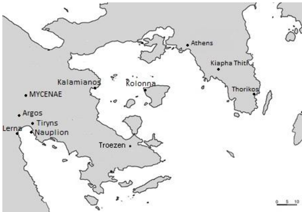
Figure 2: The Saronic Gulf and nearby regions, with LH I-III sites mentioned in the text.

The question rises as to how such a large quantity of silver from the Laurion arrived at Mycenae. It seems unlikely that Mycenae already exercised some sort of control over the Laurion as early as Late Helladic I (the era of the Shaft Graves), and it seems equally implausible to attribute the wealth in the Shaft Graves exclusively to successful raids. Instead, it is more likely that most of the objects from the Shaft Graves were acquired in the process of gift exchange between the rulers of Mycenae and other potentates 7 , most likely partners (or competitors) in a trading network centred on the Saronic Gulf, which connected the Argolid to Crete, the Cyclades, and the Near East. 8