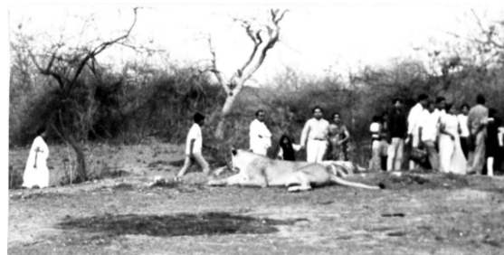
(b) A lion show in the late 1960s, illustrating how commodification had altered the Gir lions' ethologies.