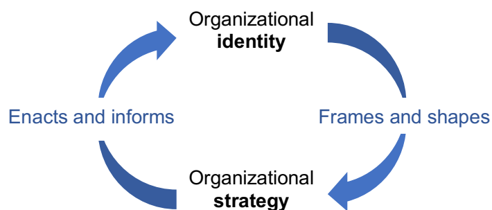
Figure 1. The interdependent relationship of organizational identity and strategy

Identity frames and shapes strategy by providing a theory (Drucker, 1994) or logic (March and Olsen, 2011) about what is appropriate, meaningful, and exemplary for the organization (Albert and Whetton, 1985; Gioia et al., 2013; Navis and Glynn, 2011). The idea that much action is driven by what is perceived to be right (Leiblein and Reuer, 2020) and good (Whetton, 2006) has been described as “ancient” and “universal” (March and Olsen, 2011) and “one of the big ideas” in organizational studies (March, 2008:5). The ways in which identity frames and shapes strategy include: defining what is looked for in the environment (Felin and Zenger, 2017) and acting as a “perceptual screen” for not only what is noticed, but also how it is interpreted, and acted on