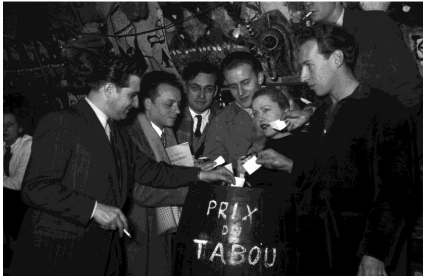
Figure 2: The votes are cast for the Prix de Tabou, 1948. At the back of the group, facing the camera, is Raymond Queneau. Vian is beside him to the right. In the background, to the left, is Simone de Beauvoir.

In his Manuel de Saint-Germain-des-Prés , Vian wrote that, being fixed in advance, the Prix du Tabou was “just like all the other [literary prizes] except for the distinction of being the only one to acknowledge this without the least embarrassment,” and thus “the only honest prize in the calendar”. 24 The prize’s first winner was Sally Mara. Not everyone was in on the joke when Raymond Queneau collected it in her absence.