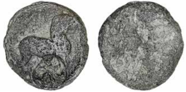
Figure 48 Countermarked coin, lead, 11.5g, British Museum, 1922,0817.10