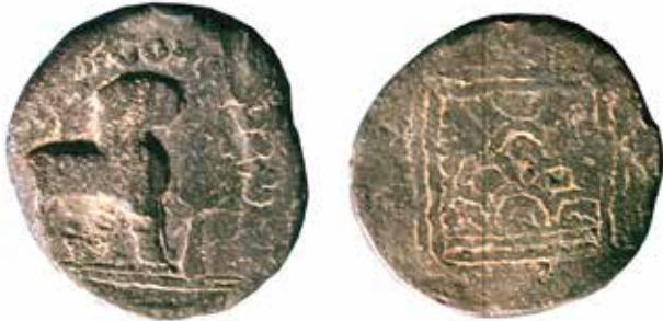
Figure 40 Coin of Sivamaka Sada, lead, 15.08g, Vaddamanu