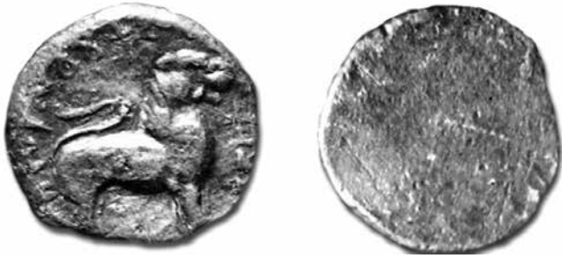
Figure 39 Coin of Sivamaka Sada, lead, 12.03g, Vaddamanu