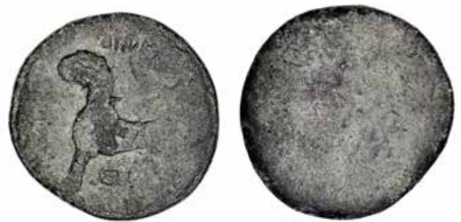
Figure 29 Coin with the title 'Aira', lead, 36.2g, British Museum, 1886,0505.7

'Aira' as a title is known from a number of inscriptions in the coastal Andhra region or the Kāliṅga-Mahīṣaka country of yore. It is appended to the name of King Khāravēla in the Hathigumpha inscription (Jayaswal 1927: 221) of the Udayagiri monastic cave complex. In the same complex cave no. 9, or 'Manchapuri cave', has an inscription of a king named 'Kudepasiri' who sports this title (Sircar 1965: 221–2). Most importantly, it was also held by Maha Sada in the Velpuru inscription (Sircar 1957: 82–6). The exact meaning of this title has eluded scholars, but Sircar suggests it means 'noble', deriving it from the Sanskrit 'ārya '. The occurrence of this title on the coin undoubtedly indicates that its issuer was either a Sada or related to other kings in the region where the Sadas flourished and claimed a kinship and/or ancestry by the use of similar titles. It would not be implausible to take it as an issue of Maha Sada, because it weighs close to his coins unearthed at Vaddamanu (see below) and he is known to have used the title.