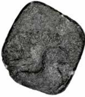
Figure 34 Coin of Asaka Sada, lead, 9.9g, British Museum, 1908,0912.3