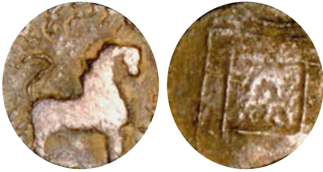
Figure 30 Coin of Siri Sada, lead, 3.7g, collection of Dr T. Devendra Rao, New Hampshire/Hyderabad