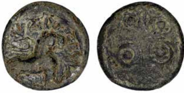
Figure 46 Coin of Siri Pulumāvi in 'lion' type, lead, 8.72g, British Museum, 1908.0912.17