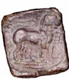
Figure 36 Coin of Asaka Sada, lead, 7.7g, collection of K.K. Maheshwari, Mumbai