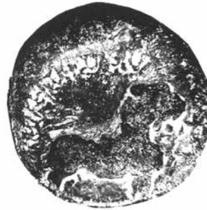
Figure 37 Coin of Asaka Sada, lead, weight not available