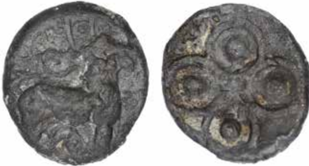
Figure 47 Coin of Siri Pulumāvi in 'lion' type, lead, 7.2g, British Museum, 1908,0912.18