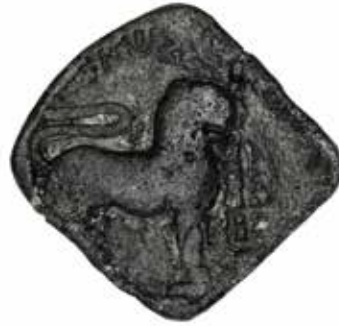
Figure 35 Coin of Asaka Sada, lead, weight not recorded, British Museum, 1908,0912.4