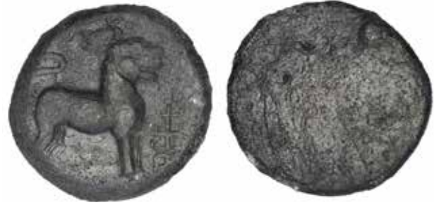
Figure 42 Unscripted Sada coin, lead, 5.5g, British Museum, 1905,1007.2