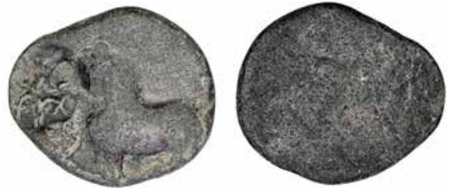
Figure 49 Countermarked coin, lead, 10.2g, British Museum, 1922,0817.15