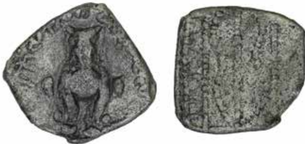
Figure 41 Coin of Sivamaka Sada, lead, 7.55g, British Museum, 1905,1007.55