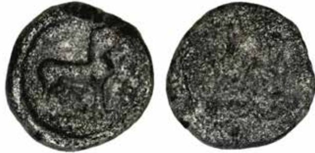
Figure 43 Unscripted Sada coin, lead, 2.87g, British Museum, 1908,0912.26