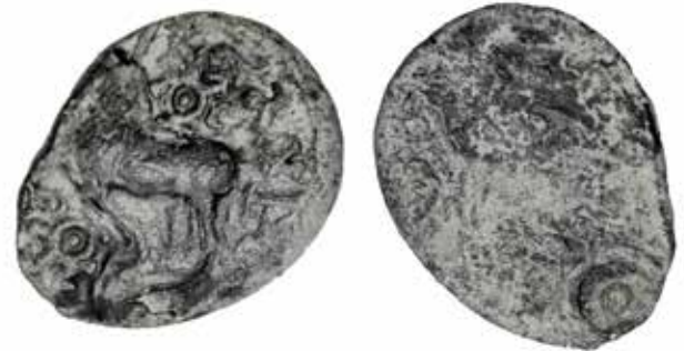
Figure 50 Countermarked coin, lead, weight not recorded, British Museum, 1905,1007.47

Example 4 (lead, weight not recorded; BM no. 1922,0817.14) (Fig. 51)