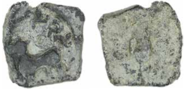
Figure 33 Coin of [Vija?]ya Sada, lead, 1.63g, British Museum, 1908,0902.27