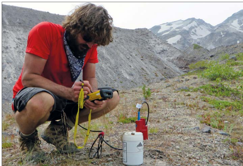
1 Small, cheap and remarkably useful: modern high-frequency seismic nodes are increasingly popular for deployments in remote areas and novel seismological situations.

In 1883, John Milne postulated that earthquake energy could be recorded at great distances (Milne 1883). This was proven in 1889 when a recording of a teleseismic earthquake (from Japan) was made by Ernst Von Rebeur-Paschwitz on a seismometer in Potsdam, Germany (Von Rebeur-Paschwitz 1889). Von Rebeur-Paschwitz soon realized that a set of seismometers deployed at stations globally could enhance