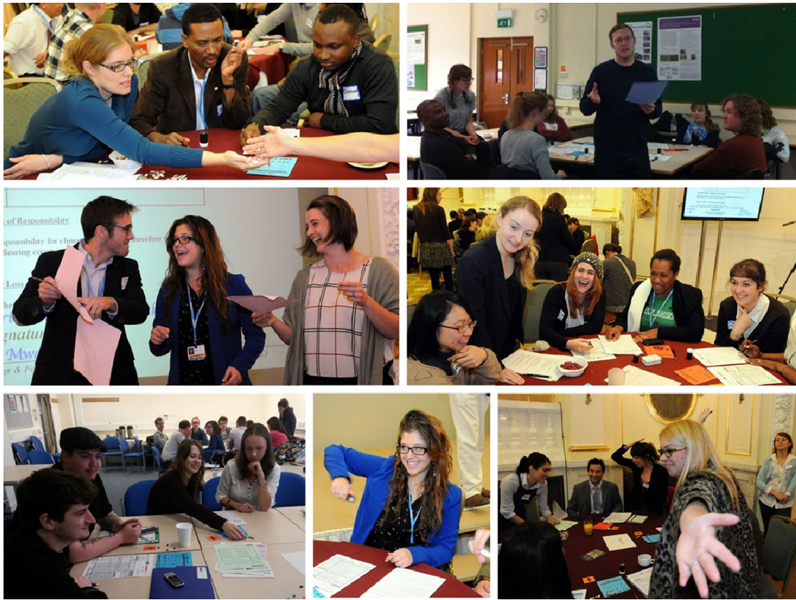
Fig. 3 CAULDRON sessions in action. Clockwise from top left: a exchanging beans during farming, b a spokesperson reading out his region's negotiated text, c discussions during play, d the shock of drought during farming, e shaking a rainmaker, f planting beans

during farming, g presenting negotiated texts. Photographs a , c , d , e , g courtesy of IISD/ENB, November 2013 ( http://www.iisd.ca/climate/cop19/dcd/ ); b by Emily Boyd, February 2015; f by Hannah Parker, September 2014