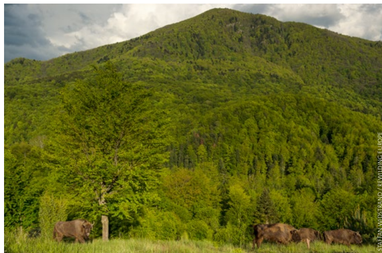
Europe has spectacular landscapes that can ‘brand’ different regions and re-invigorate European identity. Ţarcu Mountains, Southern Carpathians, Romania.

Some suggest that rewilding’s focus on processes and dynamic systems is incompatible with the Nature Directives because they were designed to conserve patterns of species and habitats in place. A combination of interacting factors has created a perception that the purpose of the directives is to maintain (or restore) habitats and populations to a desired state. These factors include: a) the ‘favourable condition’ concept interacting with habitat typologies 5 and species annexes in specifying how member states should meet their obligations under the direc-