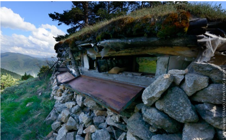
Nature and wildlife photography is a booming activity in Europe, contributing to new, nature inspired economies. Wildlife watching hide near Deven, Rhodope Mountains, Bulgaria.

Natural value is under pressure across Europe. In response to the EC consultation on the Nature Directives 19 over half a million citizens said that the directives should be maintained and better implemented and reasserted the democratic voice for nature conservation. At the same time rewilding is gaining ground as a popular movement for a wilder, more innovative, confident and forward-looking form of conservation. In short, the emerging message from citizens, scientists and conservation practitioners is that we want to safeguard what we have achieved in protecting existing natural value, but we also want to reset expectation on what is possible from nature conservation policy.