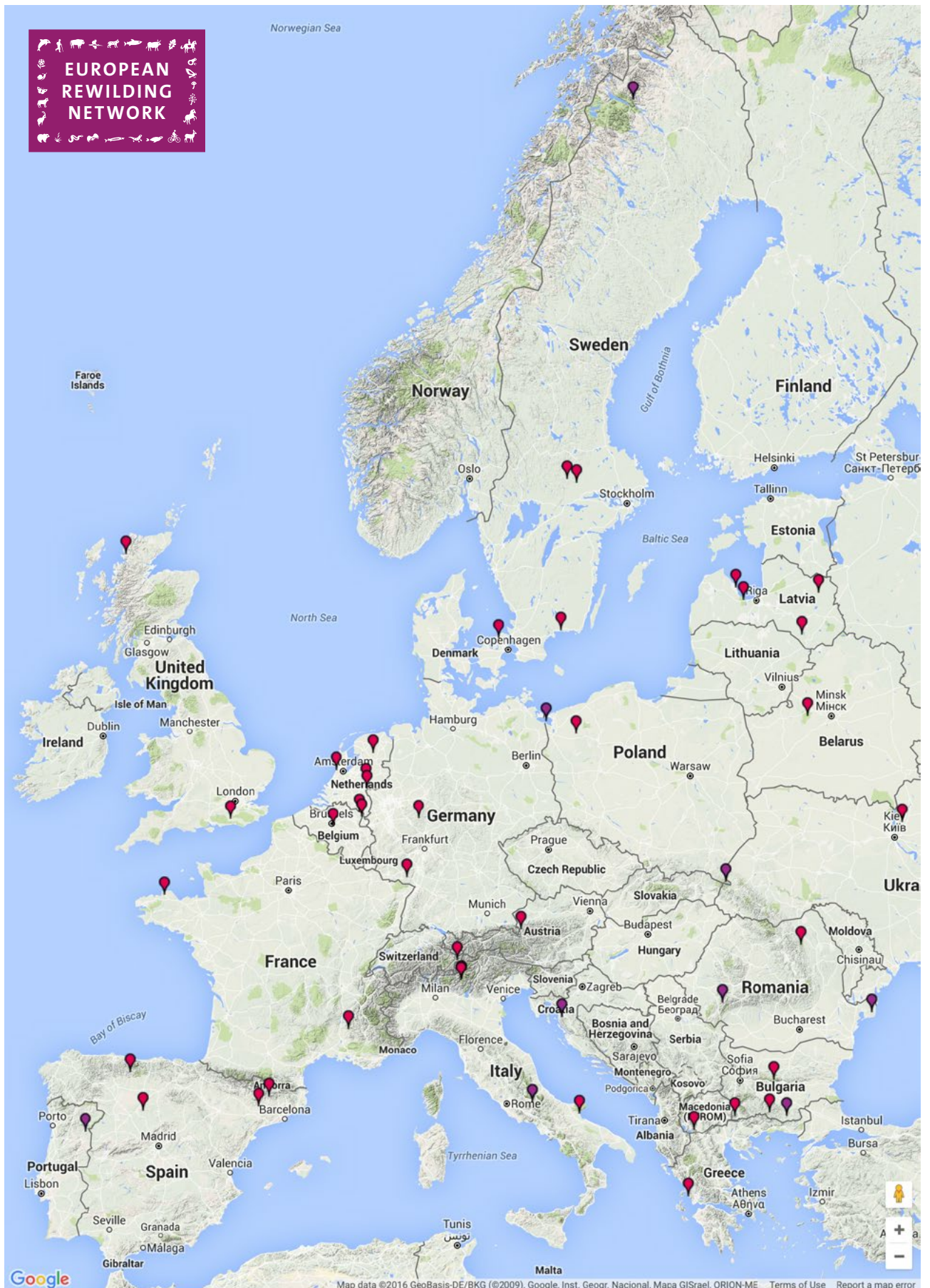
European Rewilding Network members: ● Rewilding Europe areas ● Other rewilding initiatives

Members of the European Rewilding Network (situation April 2016). This is a starting network with potentially hundreds of rewilding initiatives across Europe that are happening or are being developed.