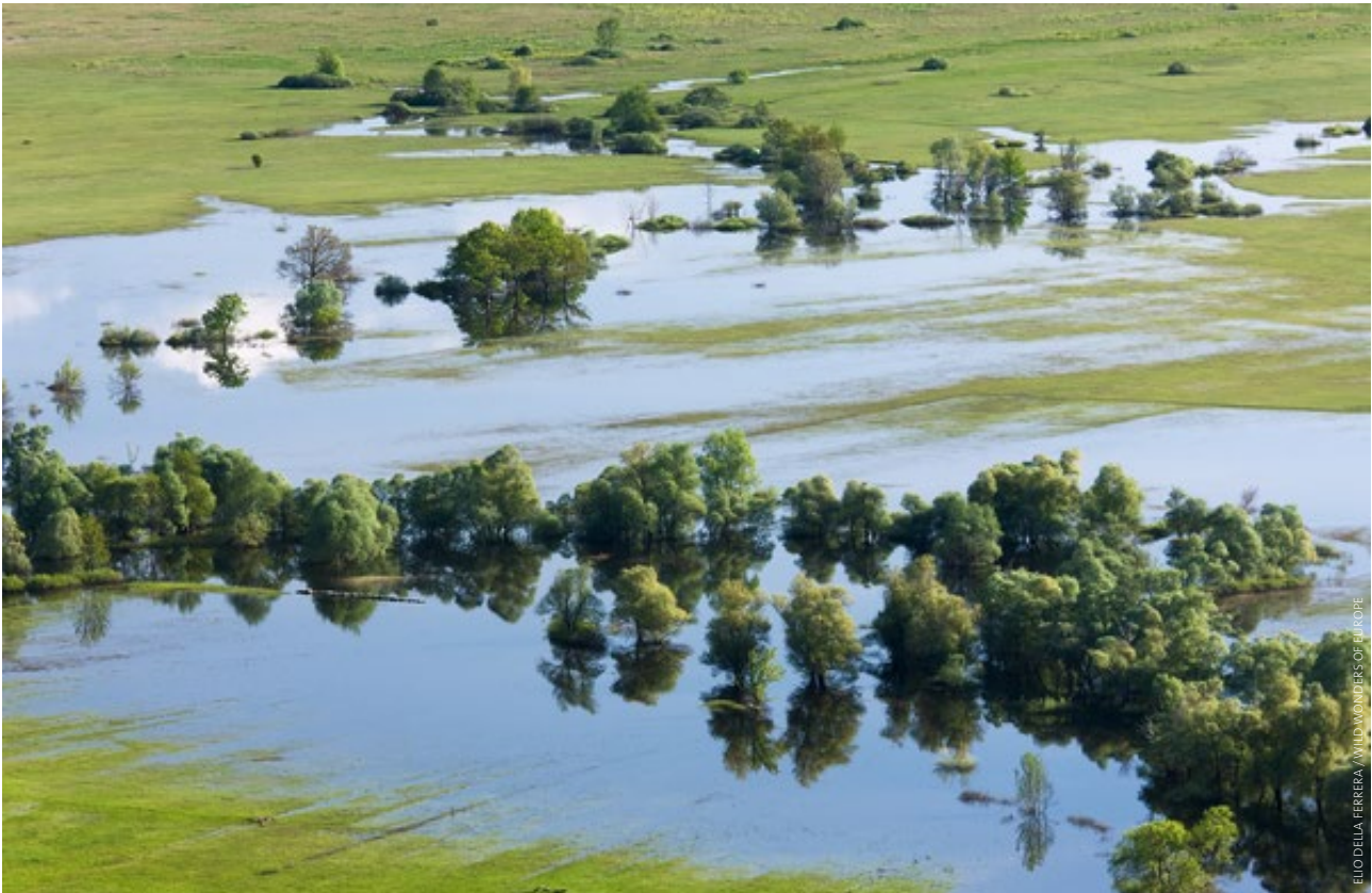
Restoring flooding regimes and flood plains are core rewilding measures, providing ecological, flood protection and economic benefits for nature and society. Flooded area in the Northern part of the Livansko Polje karst plateau, Kazanc area, Bosnia-Herzegovina.

natural values are under less pressure member state interpretations of the directives tend to offer more scope for rewilding.