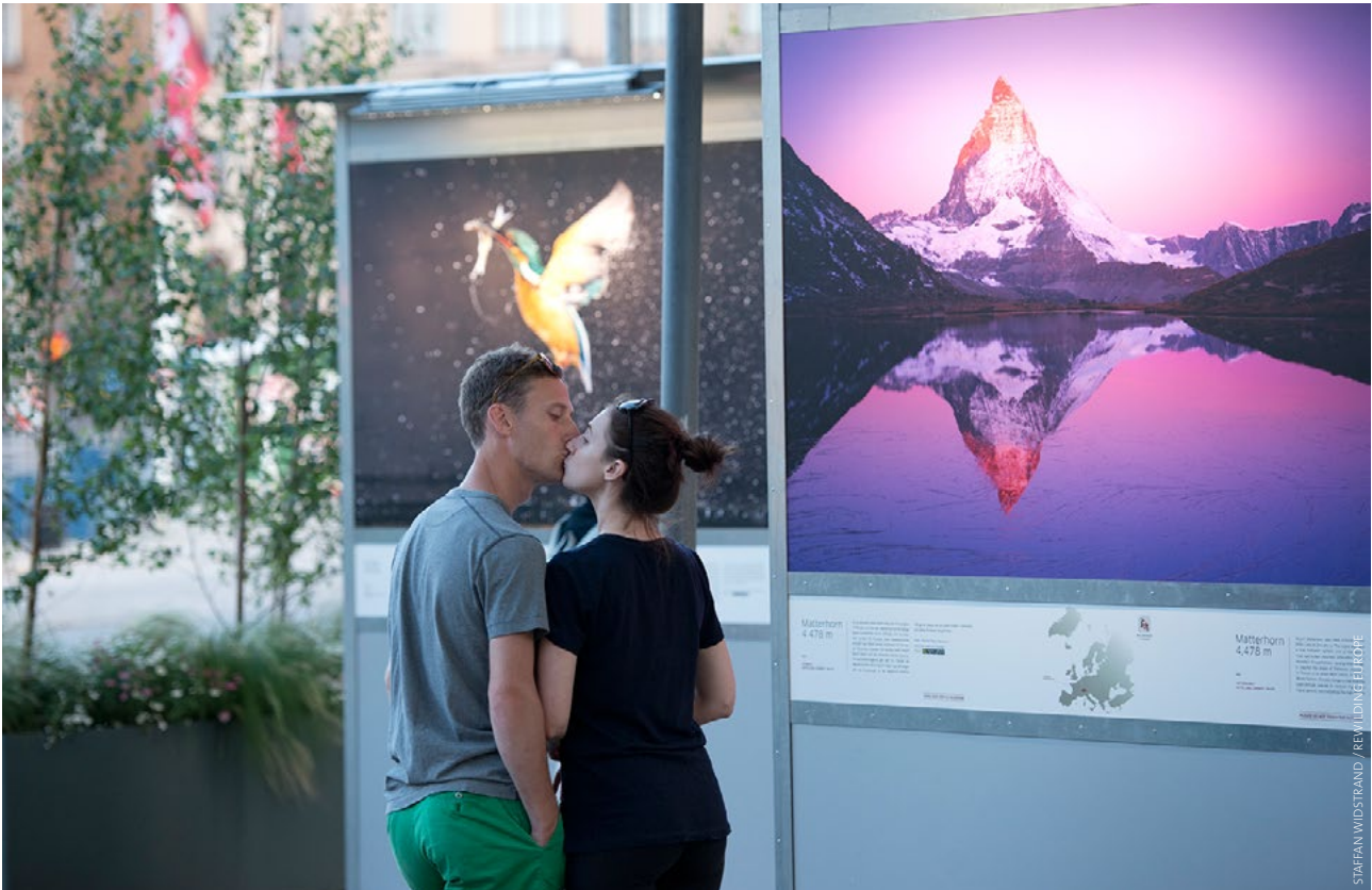
Wild nature appeals to diverse publics and seems to have particular appeal among a younger urban generation. Wild Wonders of Europe outdoor exhibition in Stockholm, Sweden.