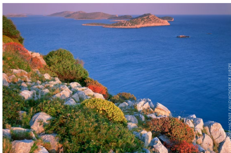
There is huge potential for coastal and marine rewilding in Europe. Kornati National Park, Mana Island, Croatia.

tives, b) the rise of performance management (management by targets) in the public and NGO sectors during the 1980s and after, and c) the need to establish the legal power of the nature directives.