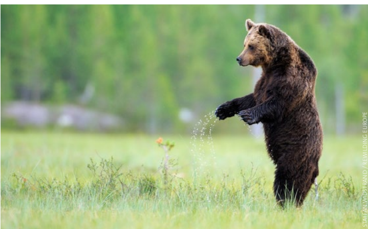
There is a strong market potential for wildlife-watching in Europe, which can contribute to the appreciation of species, mitigation of human-wildlife conflict and wildlife conservation. Brown bear in Kuhmo, Finland.

A new conservation policy vision for Europe represents an exciting opportunity for innovation, investment and significant social, ecological and economic returns for the next few decades. It also involves risk and uncertainty. A challenge for policy makers is how to find and use spaces allow innovation in nature policy and open opportunities to go beyond strict interpretations of existing law. Our assessment is that spaces for innovation exist in medium and larger Natura 2000 sites across Europe, but also by framing rewilding as a conservation agenda for the wider European countryside, including smaller and even urban areas where ecological processes can be improved. The strength of rewilding is its flexibility which derives from its focus on ‘up-grading’ ecosystems processes, using the past as a source of insight and inspiration rather than a template for restoration, and a willingness to mix nature, society and economy. As such rewilding offers a vision for a green-infra-structure where groups come together to coproduce natures that reflect context and the multi-cultural (ethnic) make-up of European society.