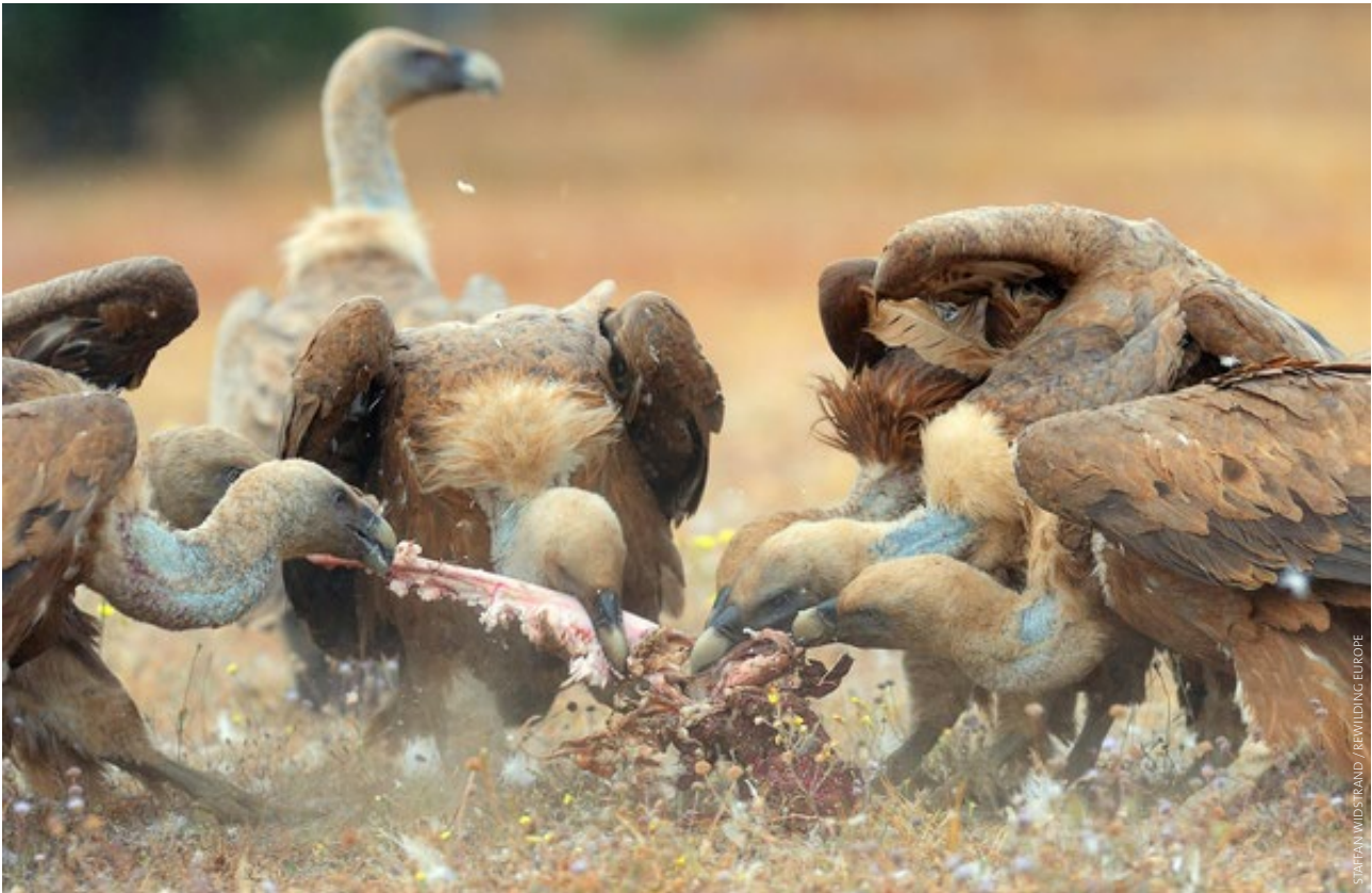
Rewilding is about restoring natural processes and ecological dynamics, like the role of scavengers in prey-rich landscapes. Griffon vultures in the Campanarios de Azába reserve, Spain.

“Rewilding opens the prospect of new partners, new allies, and new ways of making the economic case for nature.”