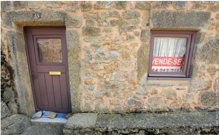
Many regions in Europe suffer from land abandonment and young generations moving to cities, with significant socio-economic impacts for rural areas. Abandoned house in Castelo Rodrigo, Portugal.