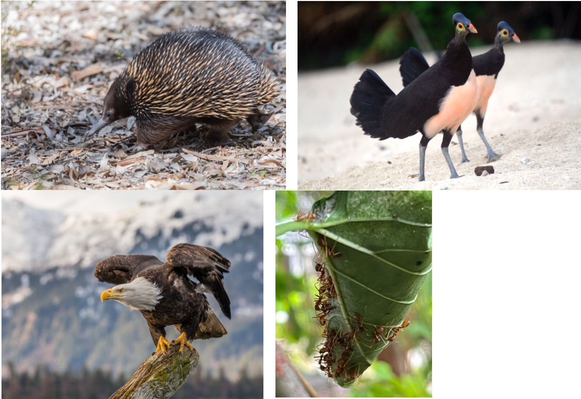
Fig. 1. Examples of relatively obvious adaptation. (a) A short-beaked echidna is protected by its spines ( Tachyglossus aculeatus). (b) The maleo ( Macrocephalon maleo ) buries its eggs in warm volcanic sand. (c) A bald eagle can see prey from 1-2 miles away. (d) Indonesian weaver ants fold and glue a leaf into a nest.