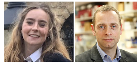
Insights from Murphy and Mead.

While short-read WES and WGS is a well-established tool to identify disease-associated SNVs in rare diseases and is now in routine clinical use (Turro et al., 2020), the difficulty in identifying SVs, partly due to their large size, often renders short-read mapping incapable of fully resolving the entire variant (Amarasinghe et al., 2020). Therefore, the authors employed long-read sequencing of a trio within the larger pedigree to enable accurate SV assembly (Amarasinghe et al., 2020). Through combinatorial data analysis, they were able to identify and characterize a duplication spanning exons 10–20 of ANKRD26 , which was part of a larger, complex paired-duplication inversion SV. Short-read WGS and targeted genotyping by a customized PCR confirmed segregation of this SV with all affected family members across multiple generations and absence of the SV in unaffected family members. Together, these data provide compelling evidence that this SV was pathogenic, causing the thrombocytopenia