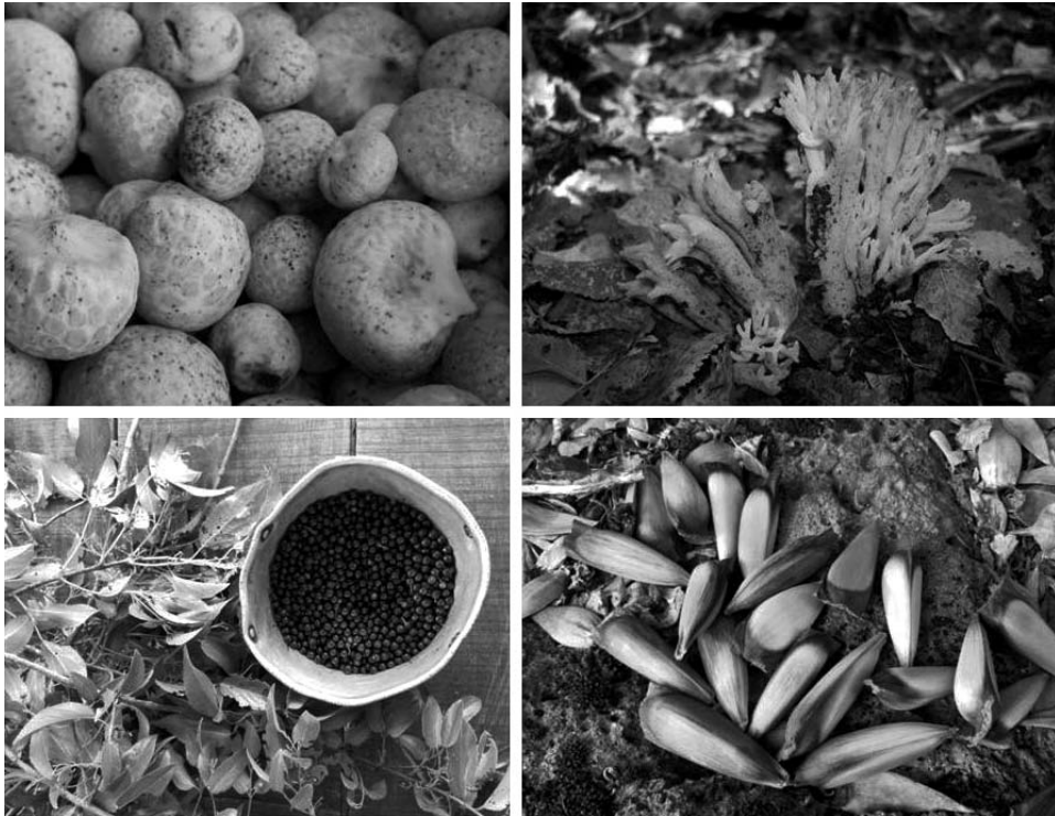
Figure 1. Most salient wild edible plants according to Smith's Saliency Index. From left to right and top to bottom: digüeñe , changle , maqui , and piñones .

cohesion and knowledge transmission (Herrmann 2006). Although people in the community do not strictly depend on the piñon anymore, families always make the effort to have piñones . Whenever someone in the extended family comes back from piñoneando (the act of gathering piñones ), it is customary to share the harvest with kin. This is especially true with elders, as they are most eager to eat wild foods. As one elder expressed, while he peeled and savored some boiled piñones that his son had brought him from the mountains, "When I taste them, I feel that I am back in the mountains."