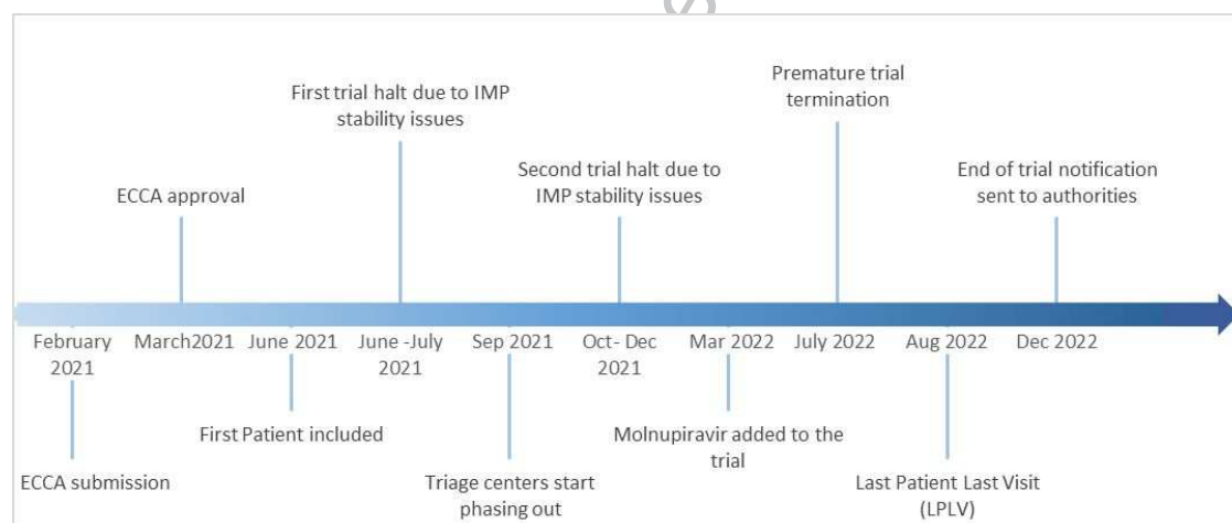
Figure 2: Trial trajectory