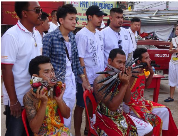
Figure A15. Mah song and their pi liang posing for photographs after completing the piercings.