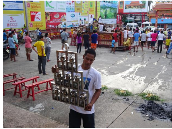
Figure A8. Nine lanterns are lit and hung from the ko teng pole for the entirety of the Festival.