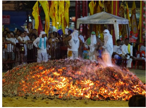
Figure A44. The pile of coals must be spread out.