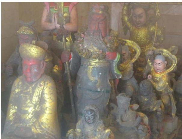
Figure A39. Statues of the gods are covered in ash after being carried on sedan chairs in street processions.