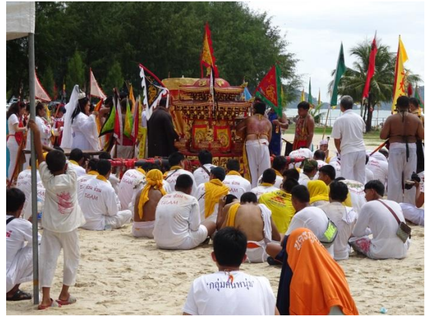
Figure A68. Prayers are led on the beach at Sapan Hin.