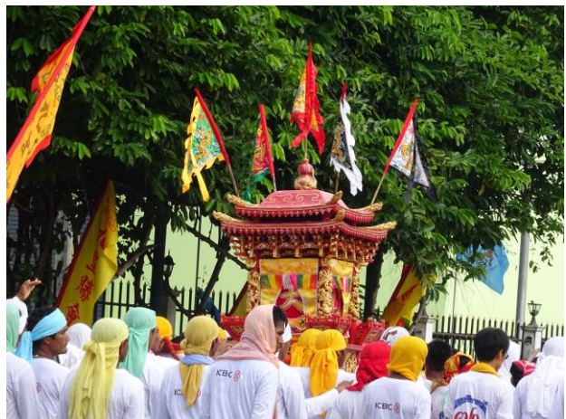
Figure A40. Firecrackers are not supposed to be thrown at the palanquin of Kiu Ong.