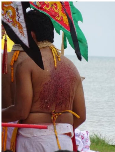
Figure A35. The skin is torn by the end of the ritual.