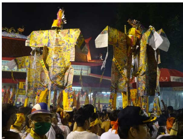
Figure A53. Paper effigies of Kiu Ong are kept out of sight until the sending-off ritual.