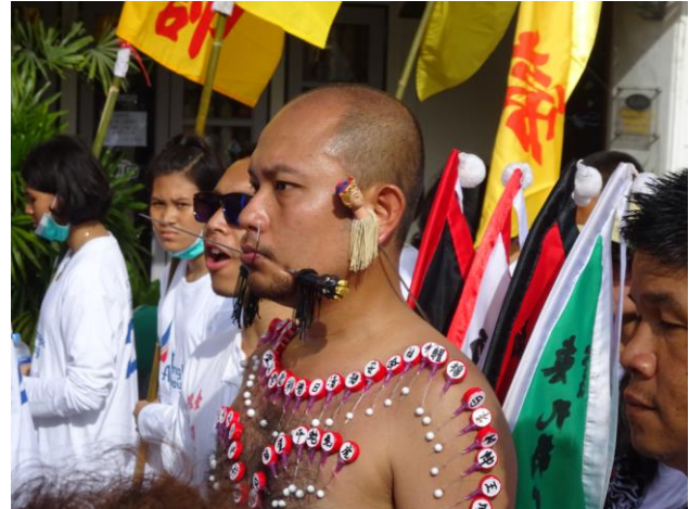
Figure A20. Piercings may go through the cheek, ears, or upper body.