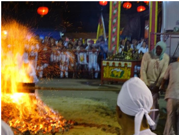
Figure A45. Four men scrape the top of the pyre.