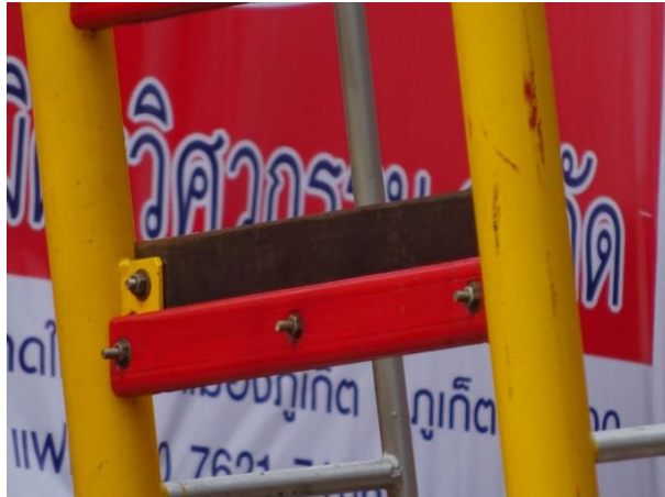
Figure A49. Only mah song climb the ladder.