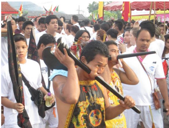
Figure A27. Axes and short swords are also common.