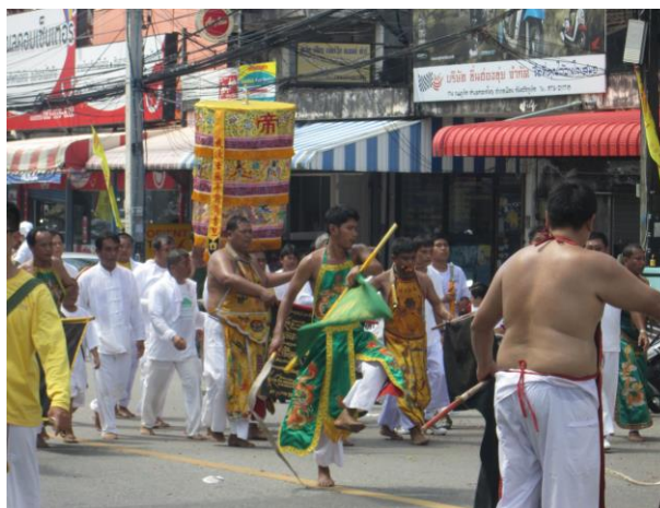
Figure A59. Trance dances involve skipping, hopping, or a combination by mah song .