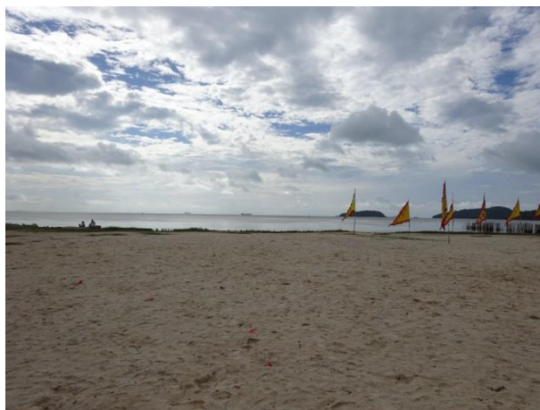
Figure A11. The beach at Sapan Hin Shrine.