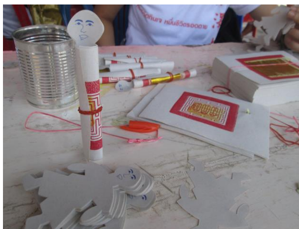
Figure A65. Charm paper is burned for health and good luck.