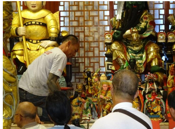
Figure A70. Devotees bring statues from home to replenish their power during the Festival.