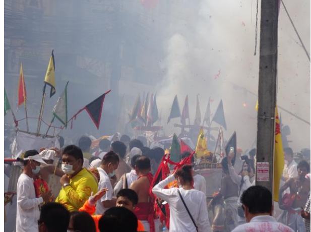
Figure A38. It is impossible to see the opposite side of the street through the smoke.