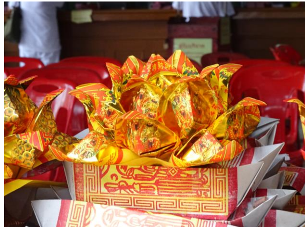
Figure A76. Joss paper is folded into boats or lotuses to be burned as an offering for ancestors.