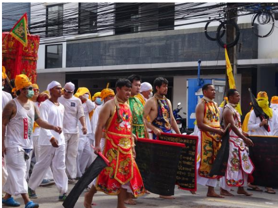
Figure A3. The Five Celestial Generals are preceding the palanquin of Kiu Ong.