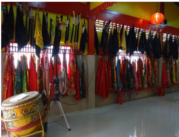
Figure A77. All of the flags and siú to of the mah song are kept at their registered shrines.