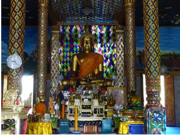
Figure A73. Traditional Thai temple interior.