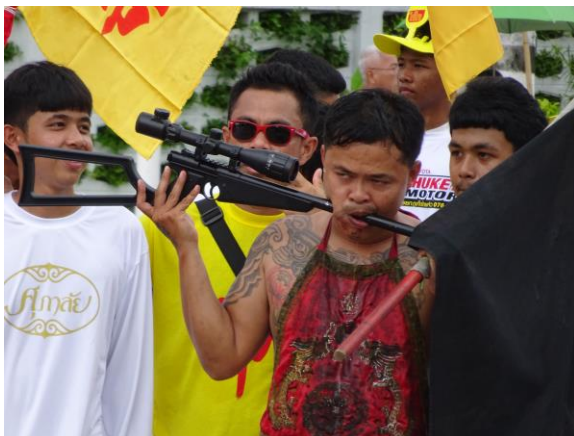
Figure A 29. Rifles and pistols were utilized by several mah song.