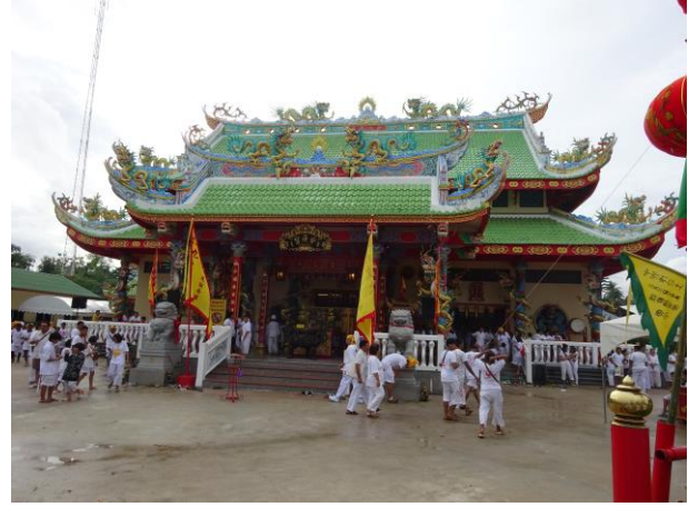
Figure A74. Traditional Chinese shrine exterior in Phuket.