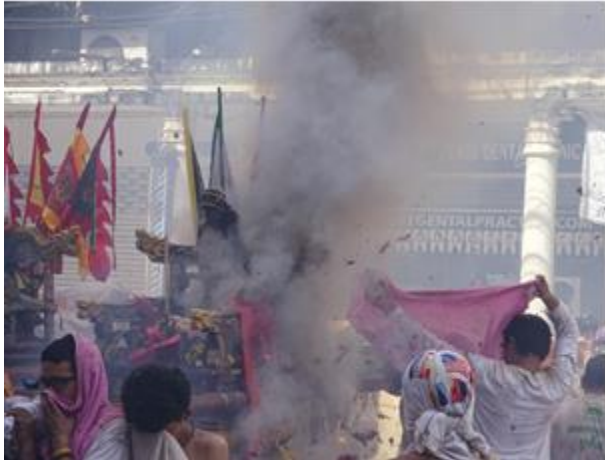
Figure A37. Pi liang protect themselves from the firecrackers' debris, smoke, and noise.