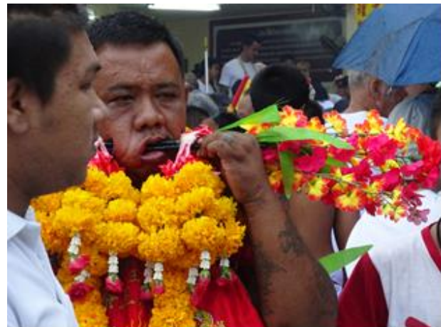
Figure A22. Flowers are less often seen as piercing objects.