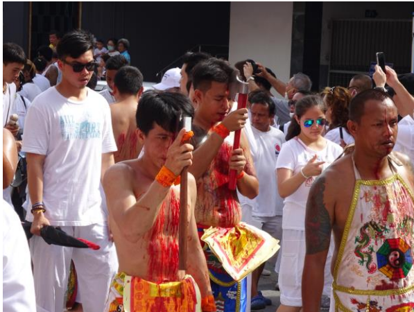
Figure A33. Axes, swords, and saws can be used to cut foreheads, backs, or tongues.