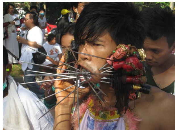
Figure A24. Heads of the gods or the Celestial Generals top the skewers.