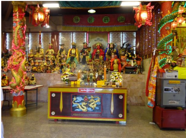
Figure A75. A standard Chinese altar in Phuket.