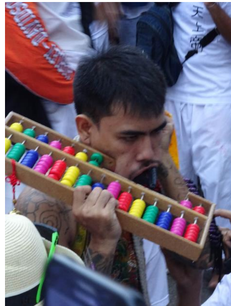
Figure A26. A child's abacus is used.