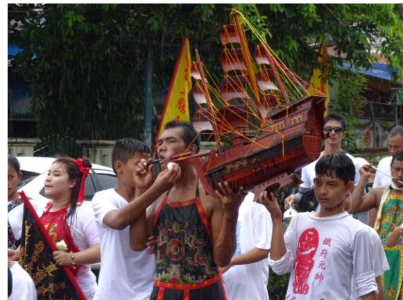
Figure A28. Piercing objects vary in size.