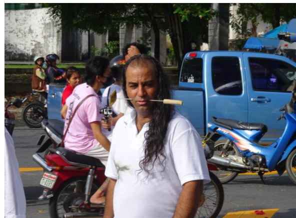
Figure A30. One mah song did not look “fully Thai” or Chinese.