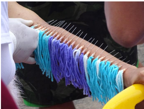
Figure A17. Medical needles are decorated with colored string.