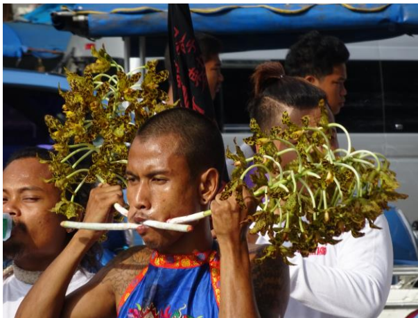
Figure A21. Vegetation is sometimes used.