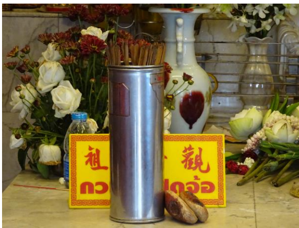
Figure A5. Divining sticks and blocks are available in the shrines for devotees' use all year.