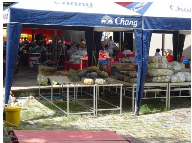
Figure A62. Larger shrines cook massive amounts of blessed, je food for free three times a day.