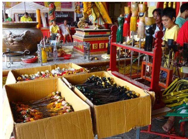
Figure A78. The principal mah song purifies whips and skewers before storing them for next year.