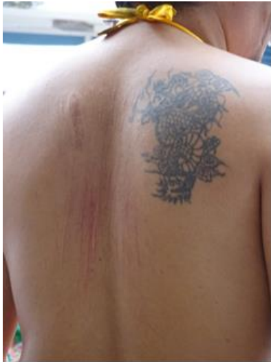
Figure A61. Scars from prior years are visible.