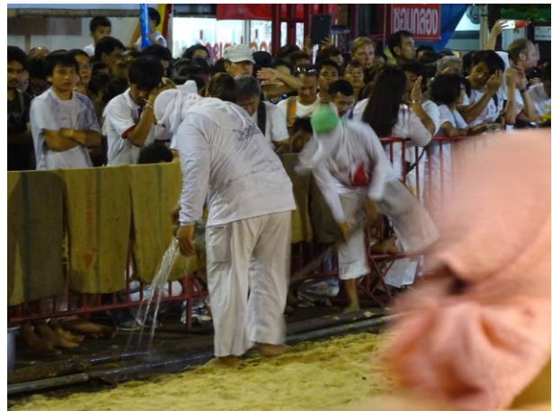
Figure A46. Water is used to cool the metal pole after each pass through the coals.