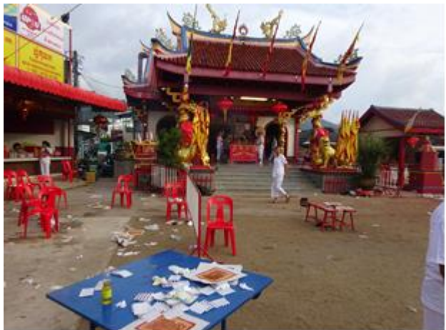
Figure A16. Charm paper, medical needles, and gauze left over after the piercings are complete.