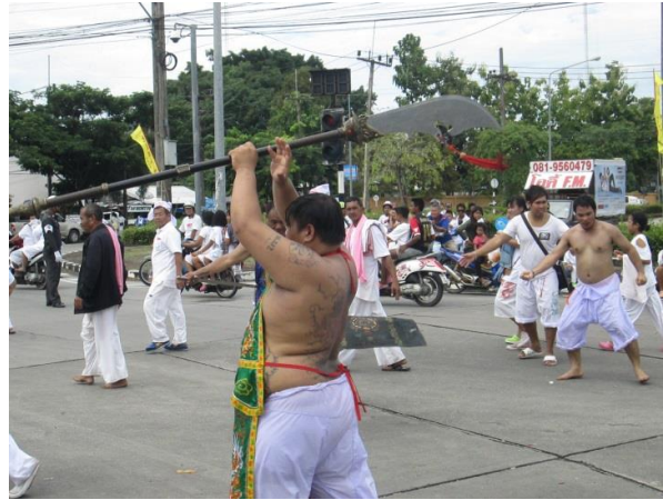
Figure A32. Evil spirits are chased away from intersections through self-infliction.