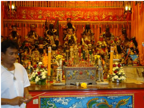
Figure A69. There are thousands of gods in the Taoist pantheon.