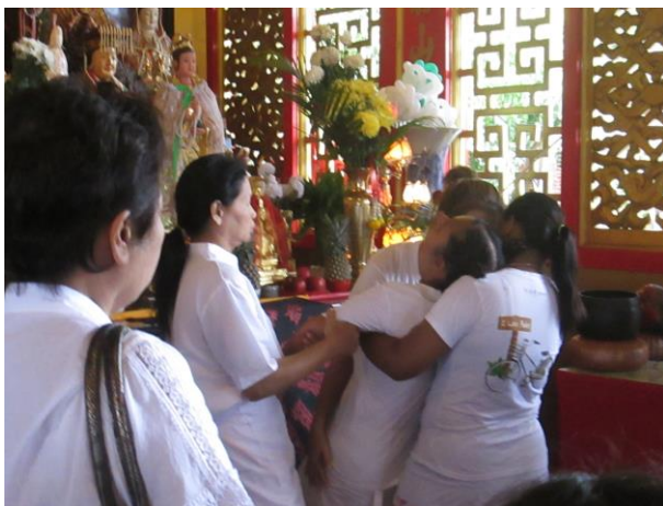
Figure A41. Pi liang catch a female mah song as the possessing god releases her.