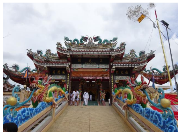
Figure A66. Devotees pray at nine shrines in one day.