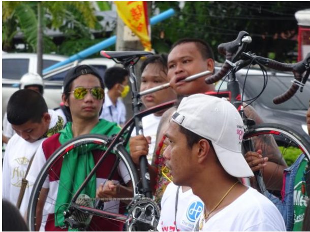
Figure A25. The materials used as piercing objects vary, e.g. an entire bicycle is used.