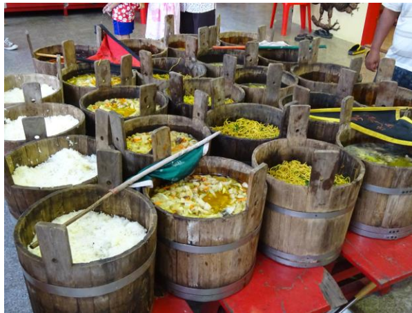
Figure A51. Flags of the Five Celestial Generals are thrown to select the food offerings.