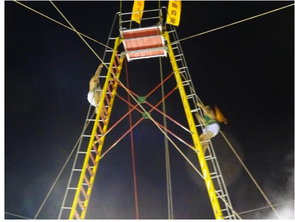
Figure A50. Charm clothes are thrown to devotees from the top platform.