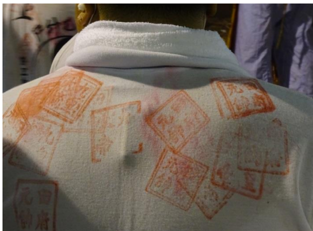
Figure A42. Stamps are "collected" from year to year from the bridge-crossing ritual.