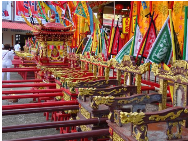
Figure A9. Rows of sedan chairs are on either side of the palanquin of Kiu Ong.