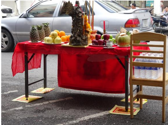
Figure A1. Street altars stand on charm paper to avoid touching the ground.