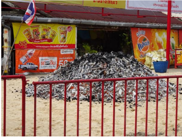
Figure A43. The pyre is lit hours before the fire-walking ritual begins.