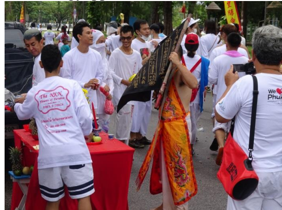
Figure A2. Blessings are given to devotees at street altars.