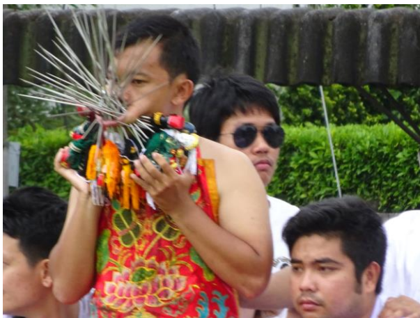
Figure A23. Skewers are common instruments.