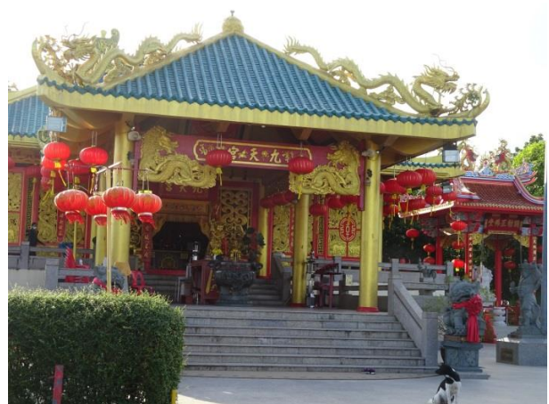
Figure A10. Sapan Hin Shrine overlooks the sea.