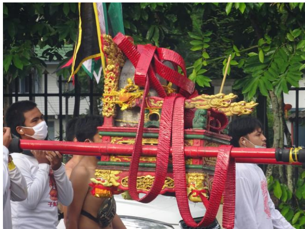
Figure A36. Strings of firecrackers occasionally wrap the sedan chairs.