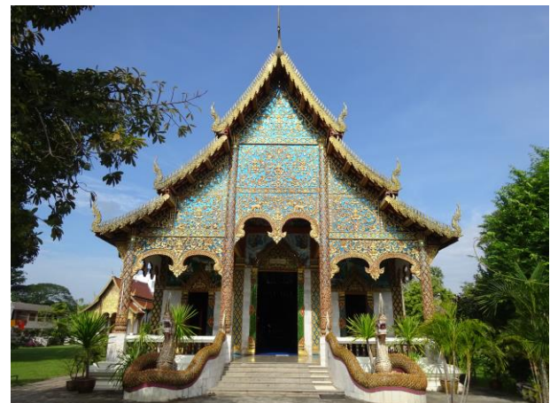
Figure A72. Traditional Thai Theravada Buddhist temple.