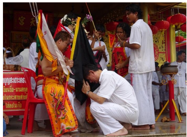
Figure A60. Devotees ask mah song for blessings.