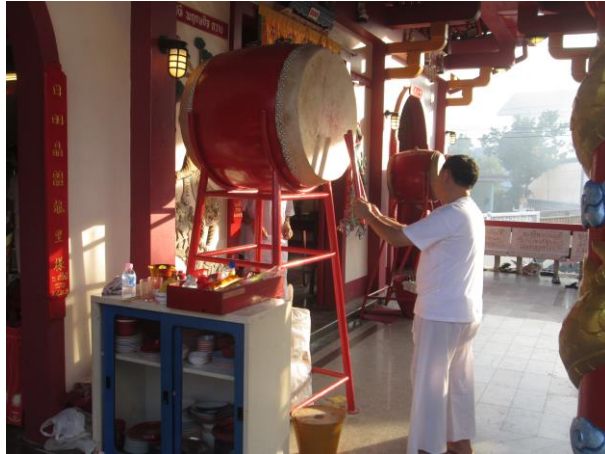
Figure A7. Drums and chimes are heard as the gods possess their mah song .