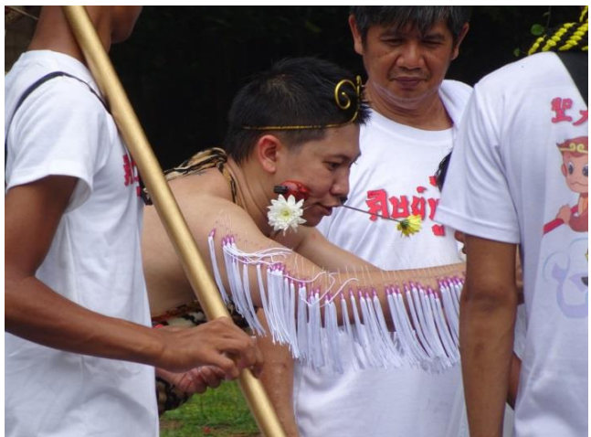
Figure A18. A mah song in a street procession ritual.