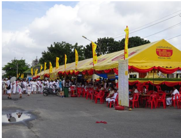
Figure A63. Devotees line up at the dining tents.