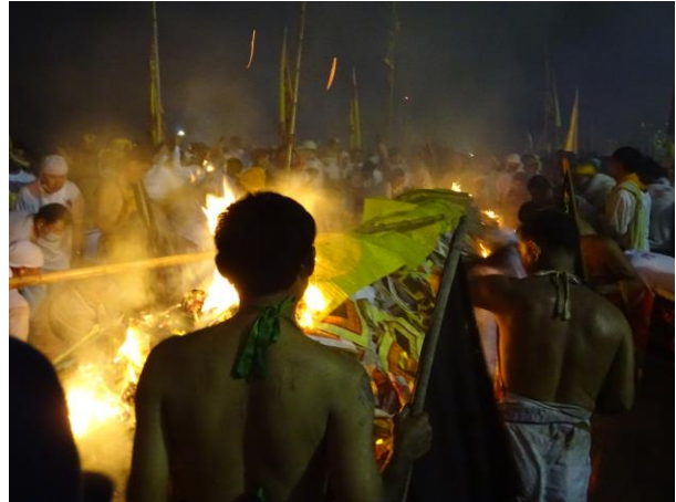
Figure A56. A make-shift boat of charm paper is burned during the sending-off ritual.