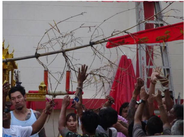
Figure A58. Efficacious twigs and leaves are broken off by devotees and taken home.