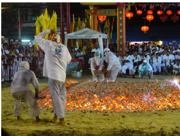
Figure A47. The metal scrape is turned sideways and swung onto the pyre to compact the coals.