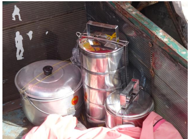
Figure A64. Special tins (center containers) are only used during the Festival to bring shrine food home.