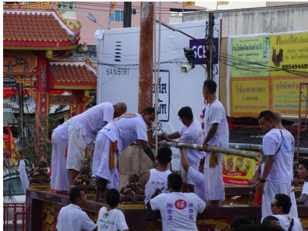
Figure A57. The ko teng pole is lowered on the tenth day.