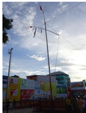
Figure A6. The ko teng pole is raised.