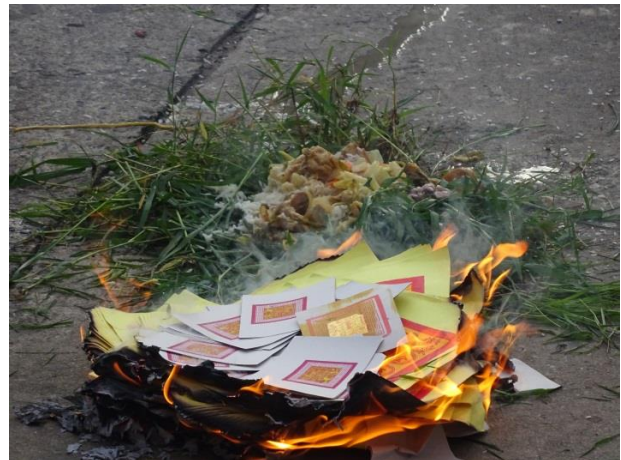
Figure A52. The offering to the Heavenly Warriors is burned.