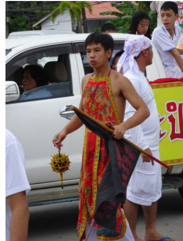
Figure A34. Prickballs may be carried to cut their backs to chase away demons.