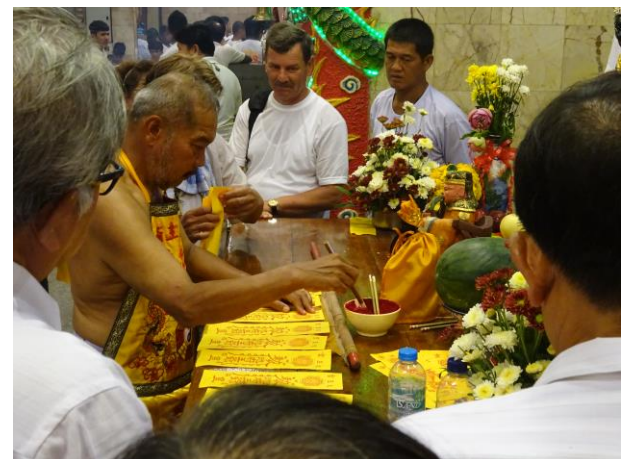
Figure A12. A possessed mah song writes in “Hokkien” on charm cloth.