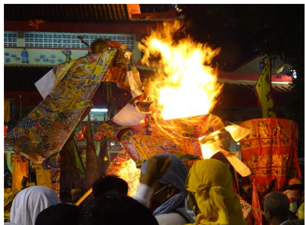
Figure A54. The effigies are burned on the final night.