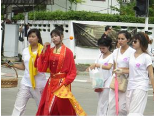
Figure A31. Female mah song are present and may undergo piercing of various degrees.