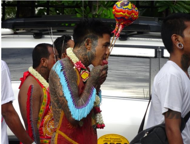
Figure A19. Many men in Phuket have elaborate tattoos.