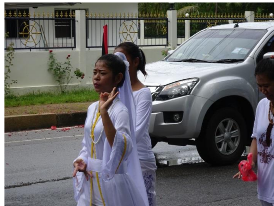
Figure A4. Hand signals linking the Festival to secret societies are still displayed.