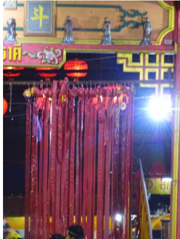
Figure A67. Firecrackers welcome and send off the gods.