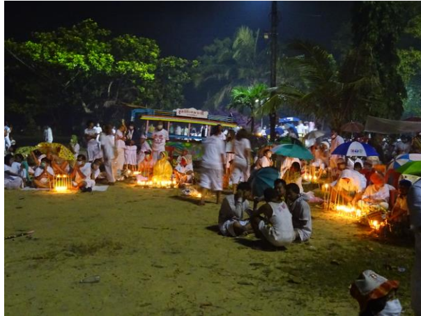
Figure A55. Silent prayers are said on the beach.