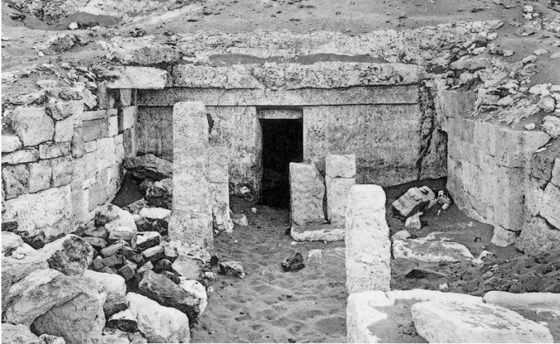
Figure 1. View of the forecourt of the tomb of Pepyankh the Middle at Meir. The rock surfaces flanking the entrance that bear the biographical texts are just visible, as is the frieze above. After A.M. Blackman, The Rock Tombs of Meir IV: The Tomb-chapel of Pepi'onkh the Middle Son of Sebkhōtpe and Pekhernefret (D, no. 2) , London 1924, pl. xxiiia.

discuss implications of the inscriptions for interpreting Old Kingdom religious institutions and religious participation. By coincidence, a new publication of the tomb by Naguib Kanawati and colleagues, with translation of the texts and treatment of related artefacts but without further discussion, appeared when my draft was nearly complete. 2 In addition, the Egyptian galleries in the Ashmolean Museum, redisplayed in late 2011, present the fine fragments of a wooden coffin of Pepyankh. 3