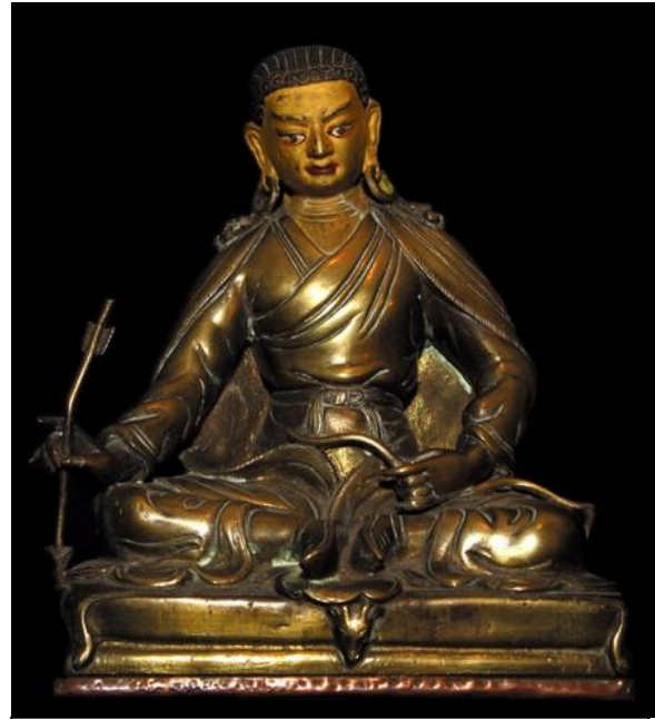
HAR item no. 73035. 'Brug pa kun legs is shown as a yogi sitting on an antelope skin.

Tibet has a long-standing tradition of such “crazy saints”. Several of the most prominent figures lived in the 15 th century, 43 a period of increasing scholasticism, and a time in which the monastic establishment became more and more involved with power and politics. The “crazy saints” have been interpreted as a counter-movement to these trends. 44 In line with this anti-institutional and counter-conventional stance, smyon pa biographies tend to be less interested in historical facts and events, but express a personal experience that is beyond the norms of contemporary society, and they contain satirical and provocative as well as poetic and spiritual elements.