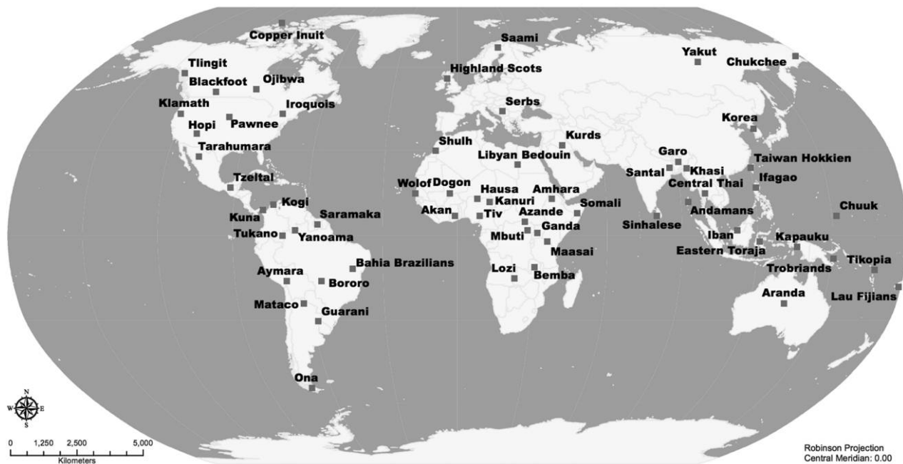
Figure 1. Locations of 60 Probability Sample Files Societies.

ative behaviors had a positive or negative moral valence. 8 Raters 1 and 2 (authors O.S.C. and D.A.M.) independently coded the full set of 3,460 paragraphs and then conferred to resolve ambiguities and discrepancies. This resulted in a total of 1,426 paragraphs that contained material germane to one or more moral domain. A hypothesis-blind independent coder (rater 3) then coded each of these 1,426 paragraphs before discussing coding discrepancies with raters 1 and 2. Of the 1,426 \times 7 = 9,982 initial coding decisions compared between the two sets of codes, there were 8,704 decisions in agreement and 1,278 decisions on which the raters disagreed—thus there was “moderate” agreement between the two initial sets of ratings overall ( \kappa = .58, P < .005 ) (Cohen 1960, 1968; Landis and Koch 1977). By type of cooperation, the degree of agreement between the two sets of ratings were: “helping kin” ( \kappa = 0.52 ; “moderate”); “helping your group” ( \kappa = 0.47 ; “moderate”);