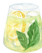
The LLM Lime Lemonade and Mint