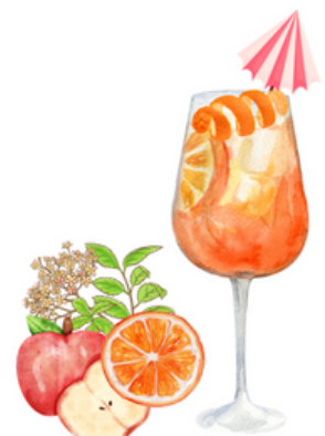
The AIEOU Apple, Ice, Elderflower, Orange soda and an Umbrella