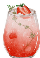
The GBS Strawberry, Basil and Soda