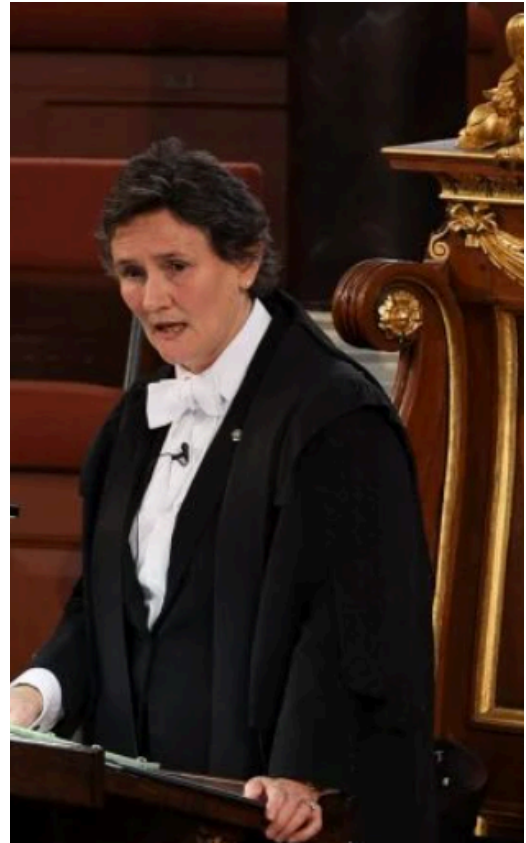
Vice-Chancellor delivering the Oration Sheldonian Theatre on 7 th October 2025.