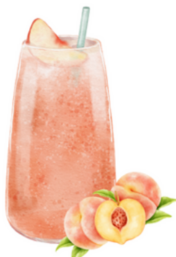
The GPT Ginger Beer and Peach Tea