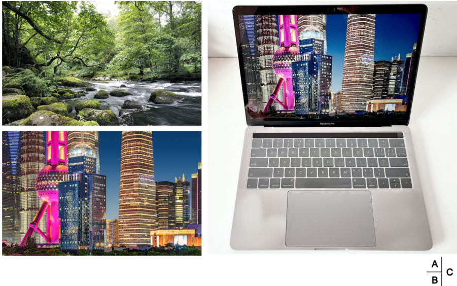
Figure 2. The nature condition (A), urban condition (B) and testing tool (C) used in Experiment 2.