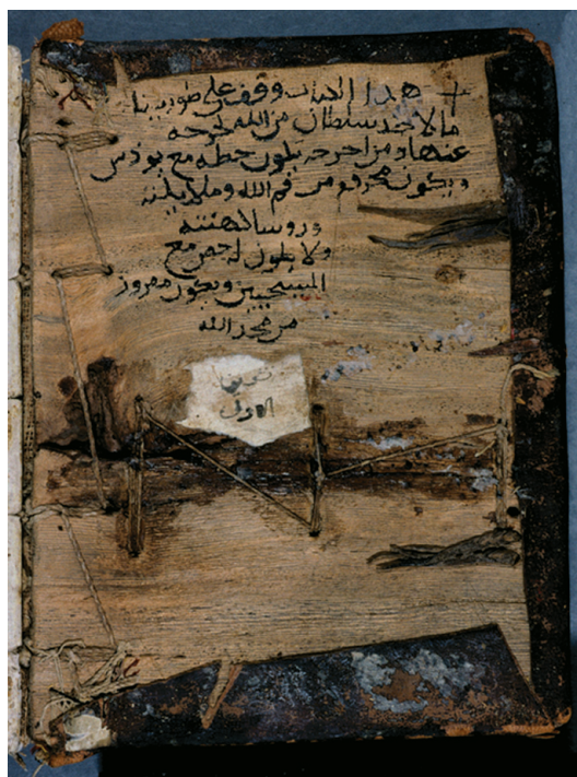
Figure 3 A full, adhesive and sewn single direction repair to a horizontal grain board (MS Greek 563, repaired board 60).