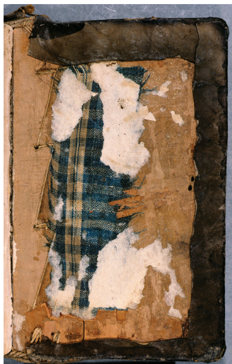
Figure 4 A full, sewn and textile patch repair (MS Greek 1275, repaired board 100).