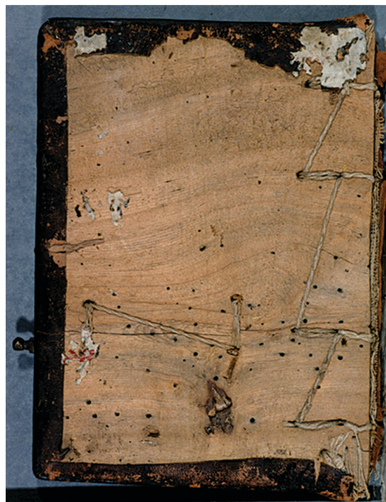
Figure 2 A partial, sewn single direction and pegged repair (MS Greek 579, repaired board 65).