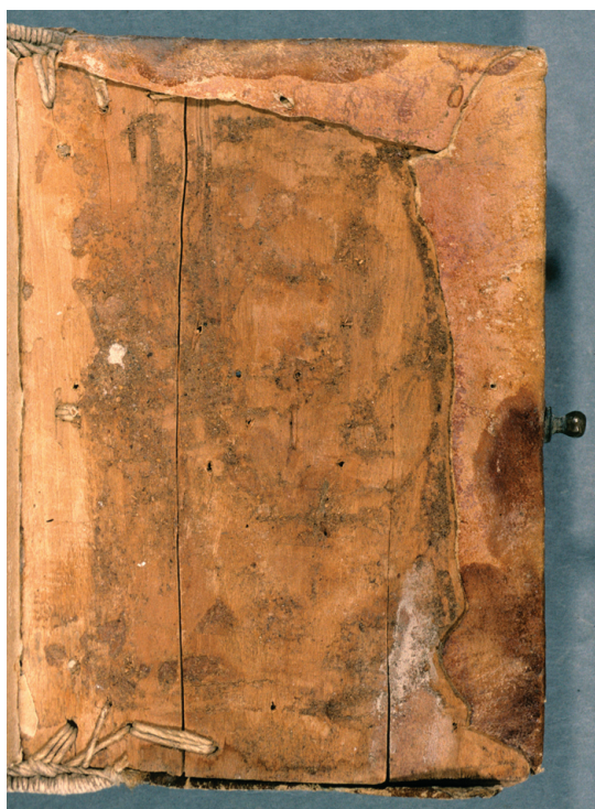
Figure 7 An 'ends only' sewn repair (MS Arabica 262, repaired board 17).

wire. For patches, paper was used in 20 cases, textiles in 13 (Figure 4), tanned leather in three and parchment in one. In MS Greek 326 (repaired board 51) a patch of recycled blind-tooled leather was used. The leather was probably cut from the covering leather of a disused bookbinding. One board (the only example of a twentieth-century repair found) had a masking tape patch.