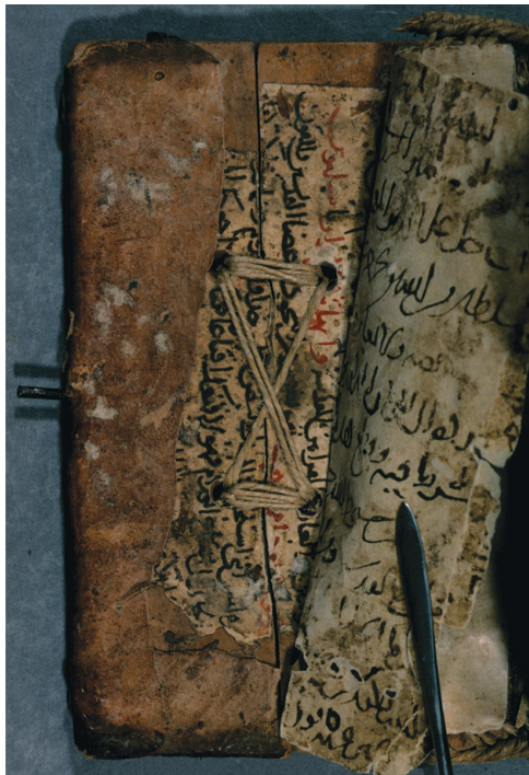
Figure 5 A partial, sewn repair in two directions (MS Greek 58, repaired board 41).

The repair materials found were those that would be familiar to bookbinders. The sewn repairs were carried out with plain threads in 79 cases. In three cases, processed skin thongs were used (one of tanned leather and two of parchment) and there was one example of a sewn repair using