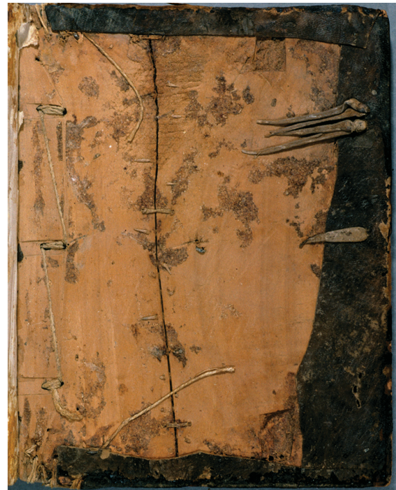
Figure 6 A full, sewn and angled-treenail repair (MS Greek 231, repaired board 46).