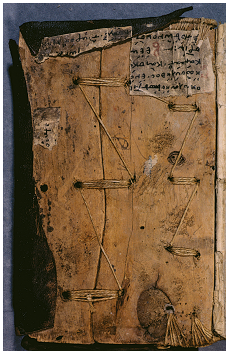
Figure 1 A full, sewn single direction repair. The board repair is continuous with the sewn board attachment (MS Greek 1104, repaired board 88).

ess of binding, with its requirement for holes drilled though the board for board and endband attachment, foredge strap anchoring and the provision of nailed bosses and book furniture, potentially weakens a wooden bookboard, leading to damage either at the time of binding or during use. In 28 exam-