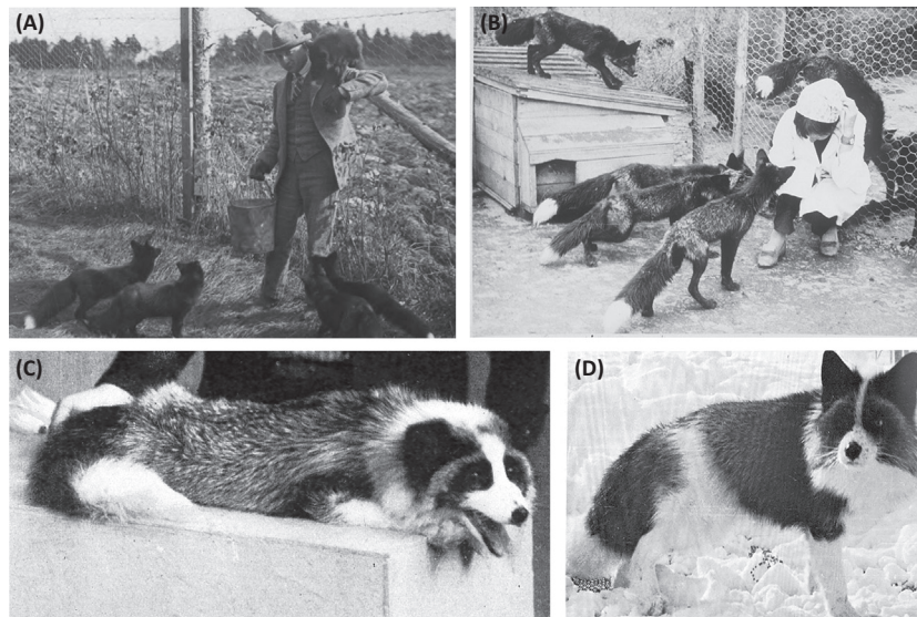
Trends in Ecology & Evolution