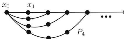
Fig. 3 A non-locally-finite graph failing the conclusion of Corollary 8.15