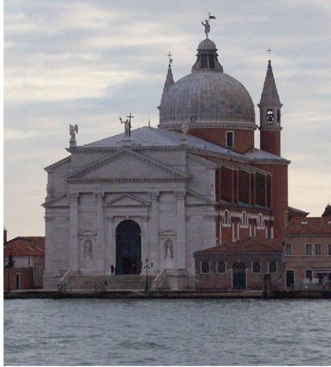
Figure 5: Il Santissimo Redentore, Giudecca, Venice

general chapter of 1587. He exercised that important office until 1592. 43 Later, from 1594 to 1597, he again served as provincial, this time in his own province, Venice. 44 During this second provincialate, he was elected a definitor general for the first time in 1596. 45 After his provincialate ended, Lorenzo was made guardian of the friary at the Redentore in