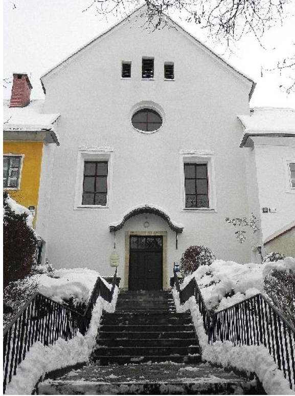
Figure 16: The Antoniuskirche of the now defunct Capuchin friary, Paulustorgasse, Graz

emigrate, with emigrants being required to pay a tax on their property. 101 Although Lorenzo arrived in Graz at this time, he offered no observations on Ferdinand personally in the usually – and frequently unfortunately – terse Commentariolum , though he may well have admired the young prince’s spiritual intransigence that was so much like his own, and approved of the ‘progress’ being made in Styria.