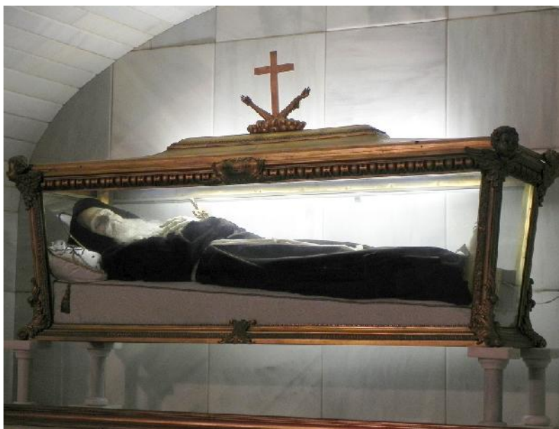
Figure 11: Lorenzo's present tomb, Presbytery of the church of the Anunciada

are kept in an urn with his effigy as he appeared when he died. 134