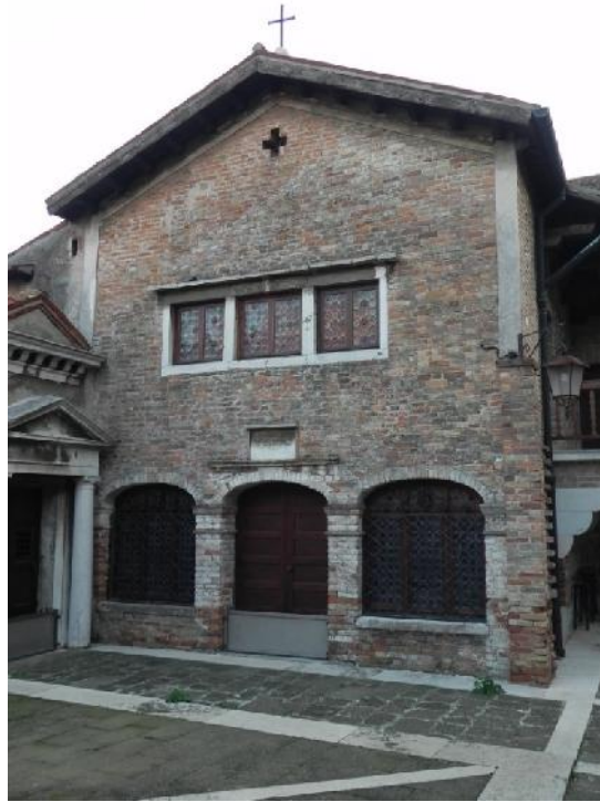
Figure 3: Exterior of S. Maria degli Angeli, Giudecca, Venice