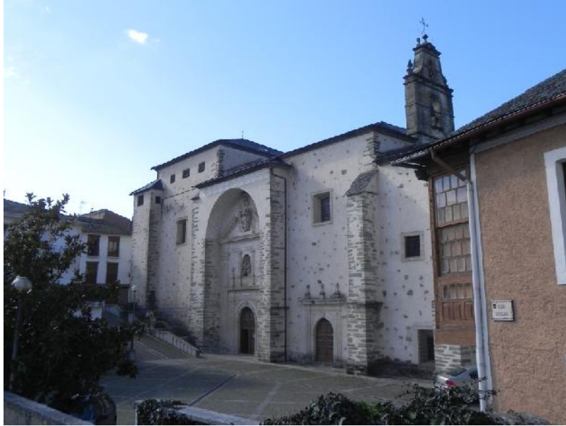
Figure 9: Exterior of the church of the Anunciada, Villafranca del Bierzo