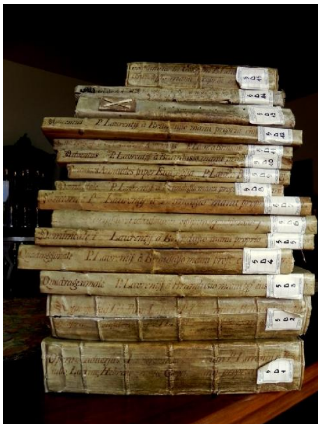
Figure 12: Lorenzo's manuscripts, Archivio Provinciale Cappuccini Veneti, Mestre