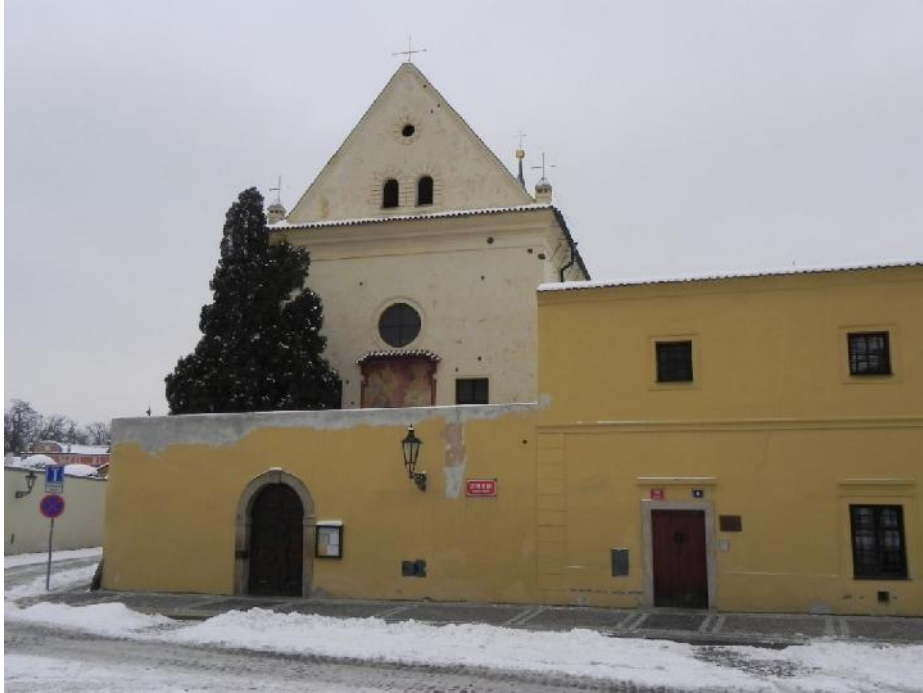
Figure 14: Exterior of St Mary of the Angels and the present Capuchin friary, Loreta Square, Prague