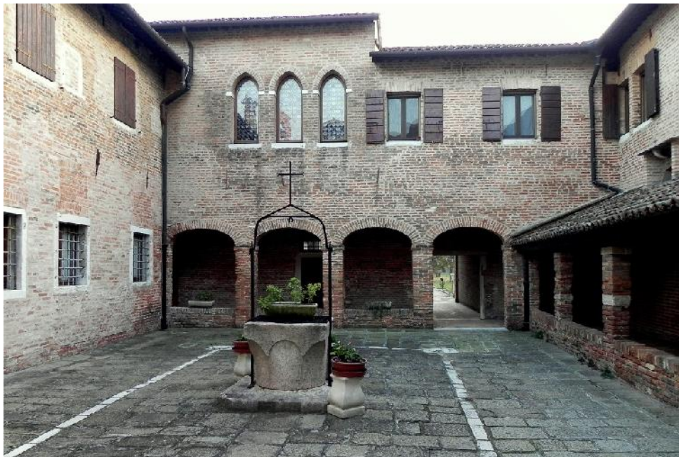
Figure 4: The cloister of S. Maria degli Angeli