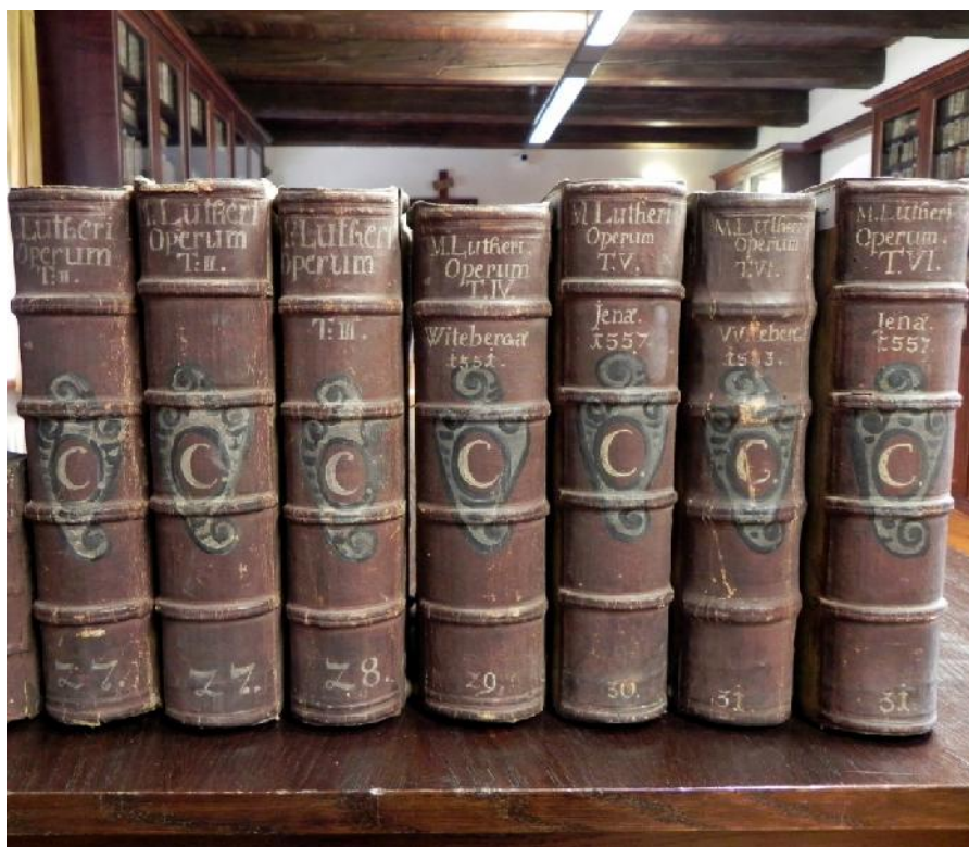
Figure 22: The seven remaining volumes of Luther's German Opera consulted by Lorenzo, Capuchin Provincial Library, Prague

where they can still be accessed. 80 Lorenzo did not leave any written observations in these texts about what he was reading, something that would not be hard to notice given his