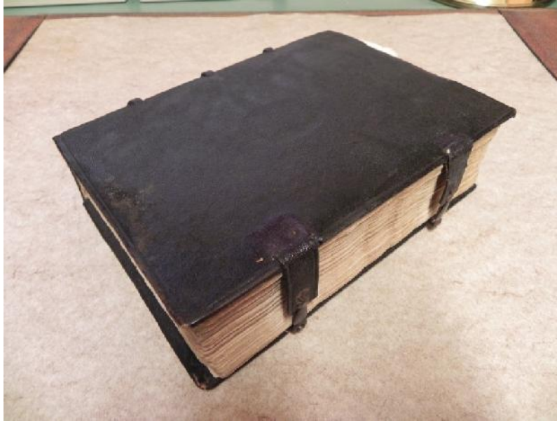
Figure 17: The ‘Codex vindobonensis’

Ascension, Pentecost, and other solemnities, was published as vol. 10.2, the Sermones de tempore . 24 With the appearance of vol. 10.2, the Apostolic Doctor’s Opera omnia really did now seem to be complete.