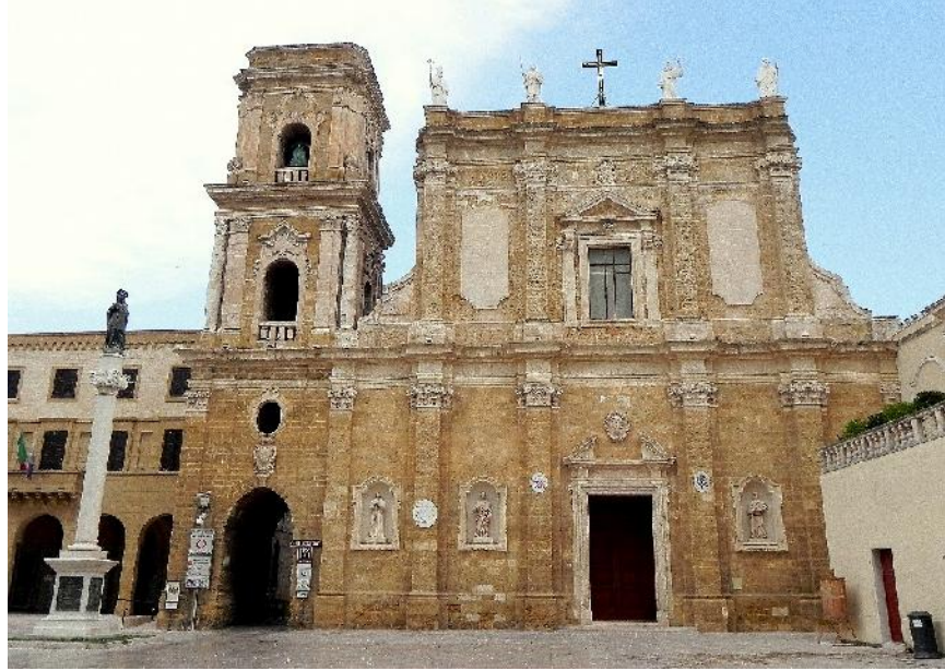
Figure 1: Exterior of the present Duomo of Brindisi