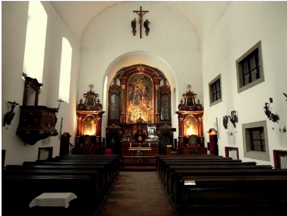
Figure 15: Interior of St Mary of the Angels