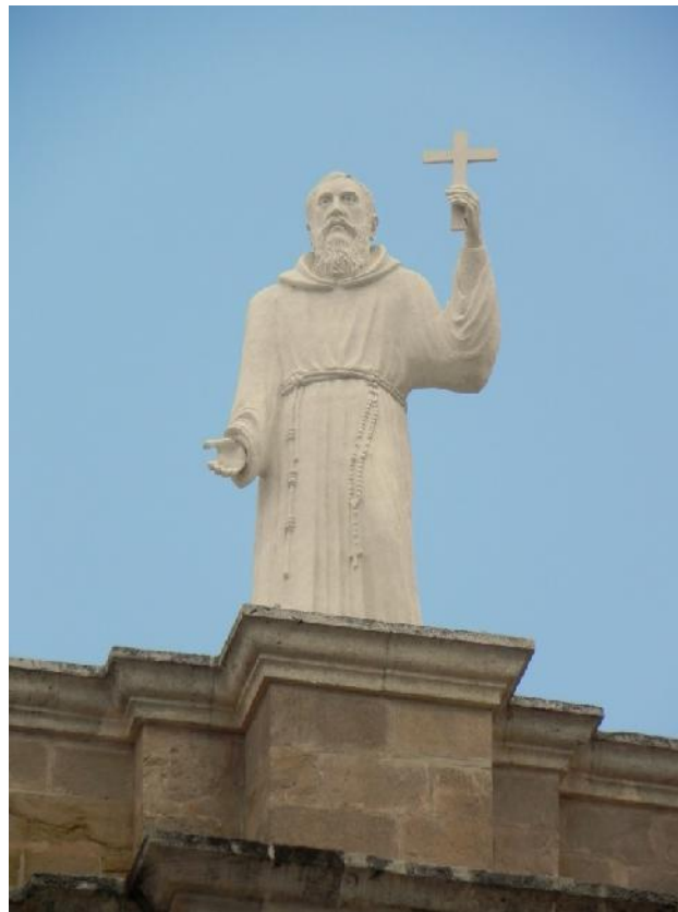
Figure 2: The statue of Lorenzo (2006) above the façade of the Duomo of Brindisi