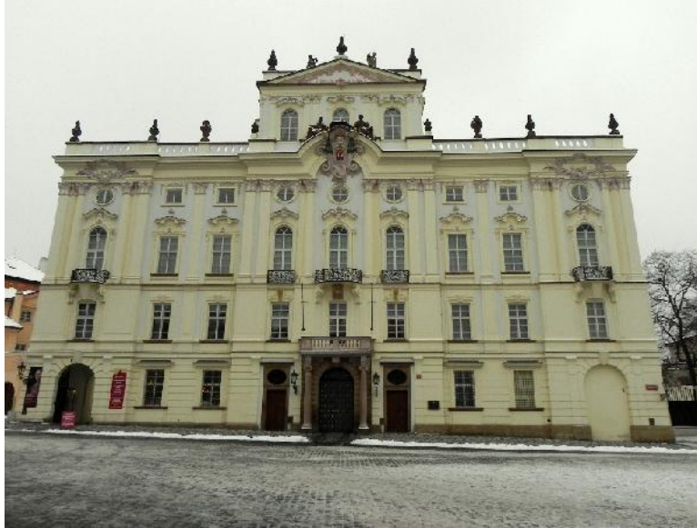
Figure 13: The present archiepiscopal palace in Prague, Hradany Square