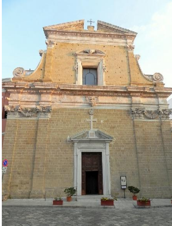
Figure 7: Exterior of S. Maria degli Angeli, Brindisi

of S. Maria degli Angeli – it shared the name of the chiesetta at the Giudecca – that he had constructed, with the aid of Maximilian of Bavaria, over the site of his childhood home. 119 At the end of September, in Caserta, he received word that he had to return to Naples, where, shortly thereafter, he was informed of the situation. He accepted this new mission, albeit reluctantly. 120 Despite Osuna's attempts to prevent Lorenzo from reaching Spain, the Capuchin reached Madrid in early May 1619. There he learned that Philip was away and