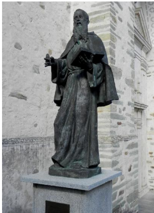
Figure 10: Statue of Lorenzo with the attributes of a doctor Ecclesiae (1996), Plaza Anunciada