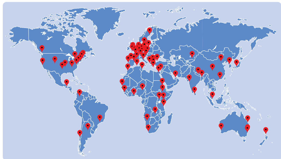
Fig 1 | Geographical distribution of the multidisciplinary experts

This paper addresses an important gap in the field of healthcare AI by delivering the first structured and holistic guideline for trustworthy and ethical AI in healthcare, established through wide international consensus and covering the entire lifecycle of AI. The FUTURE-AI Consortium was started in 2021 and currently comprises 117 international and interdisciplinary experts from 50 countries (fig 1), representing all continents (Europe, North America, South America, Asia, Africa, and Oceania). Additionally, the members represent a variety of disciplines (eg, data science, medical research, clinical medicine, computer engineering, medical ethics, social sciences) and data domains (eg, radiology, genomics,