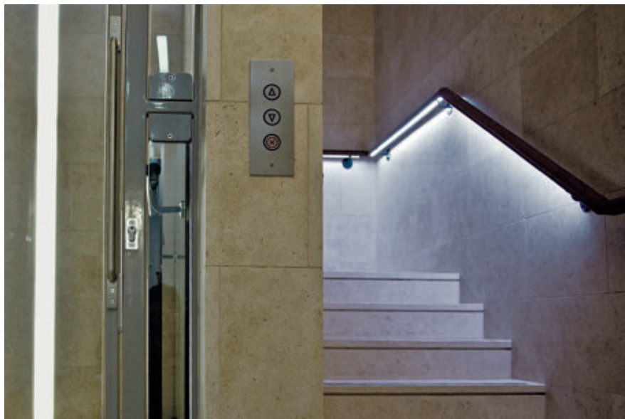
Figure 14.6: The stairwell to the Radcliffe Camera

achieved two significant benefits. Instead of flashing on rather harshly and distracting readers sitting nearby, the lighting in the stack areas comes on gently and goes off gently again at the end of its cycle. In turn the gentle and irregular change of lighting level serves to give a natural, random feel which disguises the fact that no natural light at all penetrates this underground area.