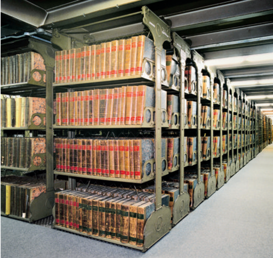
Figure 14.1: The Gladstone shelving

Stairs led from the Bookstore to the lower room of the Radcliffe Camera, and a tunnel led to another staircase providing access to the Old Bodleian. The final phase of historic transformation came in 1941 at the time of the building of the New Bodleian Library and the book conveyor from the New Library to the Old. (Figure 14.2) The Underground Bookstore remained a closed stack, like the main bookstack in the New Bodleian, but the lower room of the Camera was cleared and converted into a reading room. The tunnel alongside the conveyor connected with that coming from the Camera. However, this link between the buildings remained closed to readers, who still had to enter each building separately. Apart from some minor refurbishments, this arrangement continued largely unchanged until 2011 and the completion of the Underground Bookstore and Old Bodleian Access (UBOB) Project.