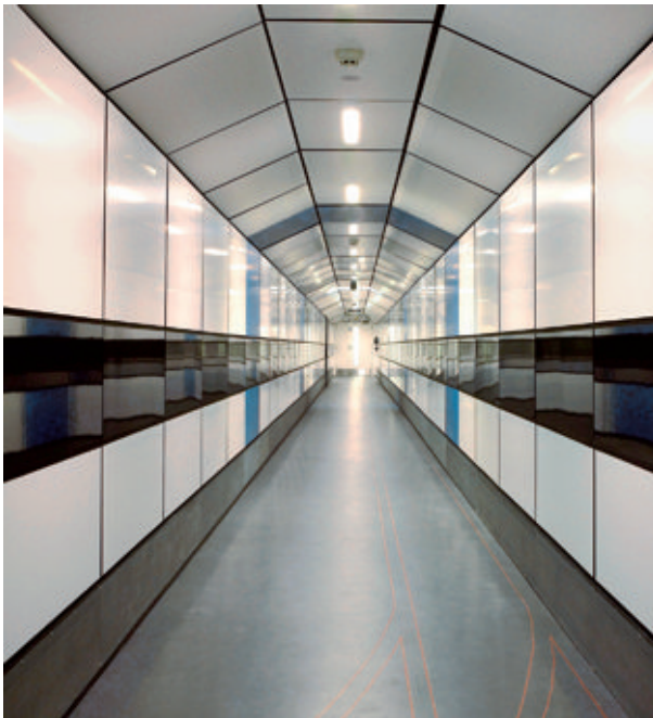
Figure 14.5: The tunnel – after