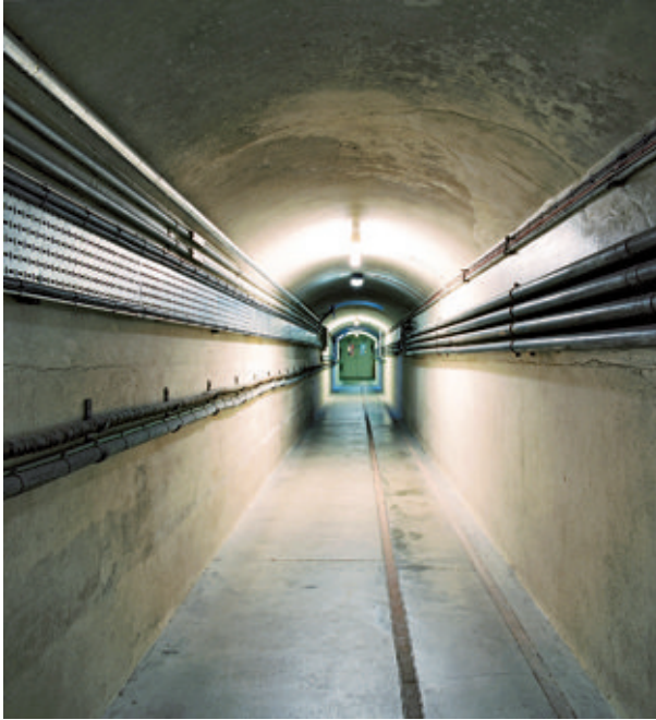
Figure 14.4: The tunnel – before