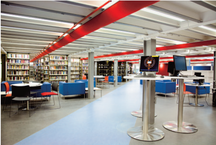
Figure 14.7: Informal study area (showing air socks and retained Gladstone shelving)