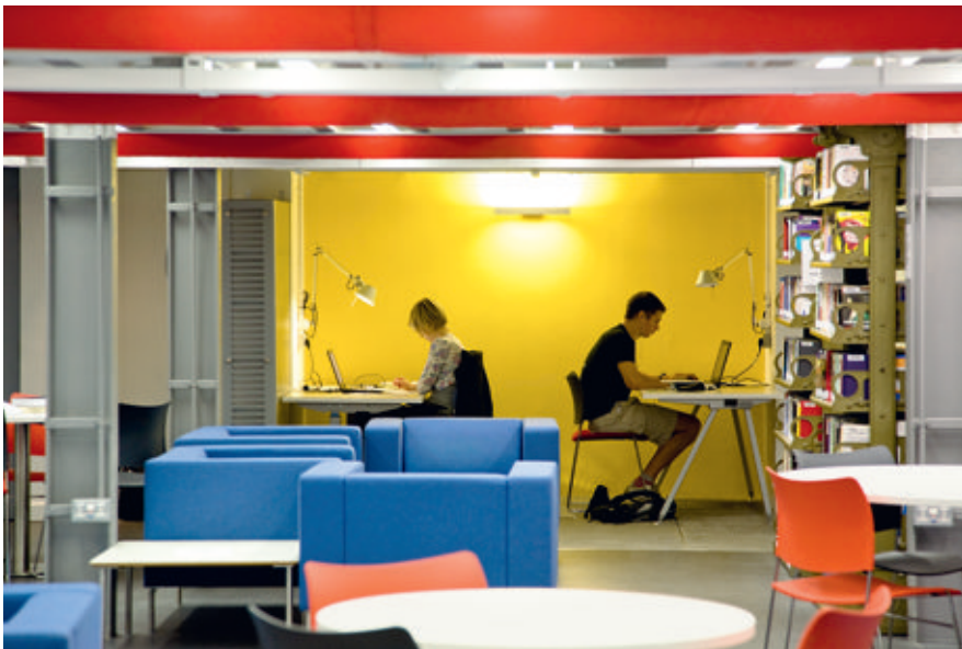
Figure 14.8: Quiet study area