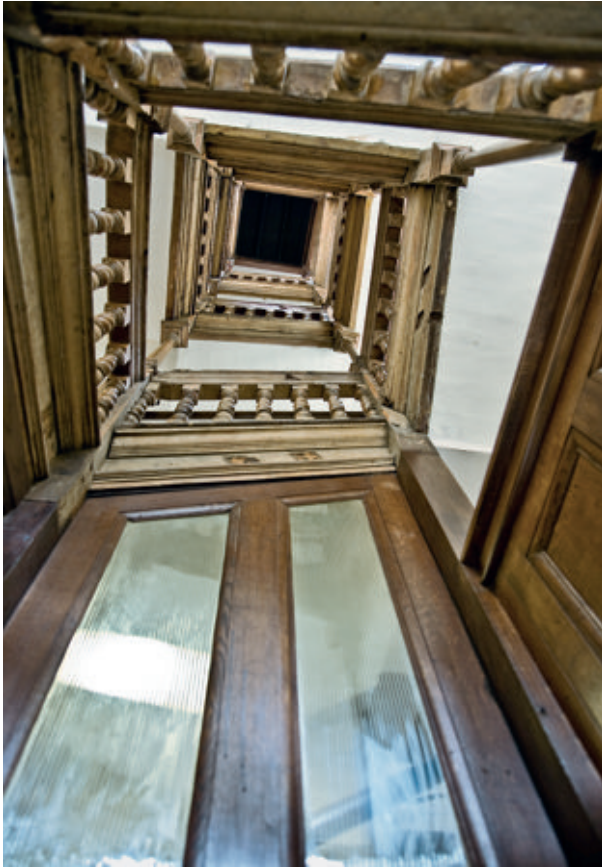
Figure 14.3: Old Bodleian stairwell