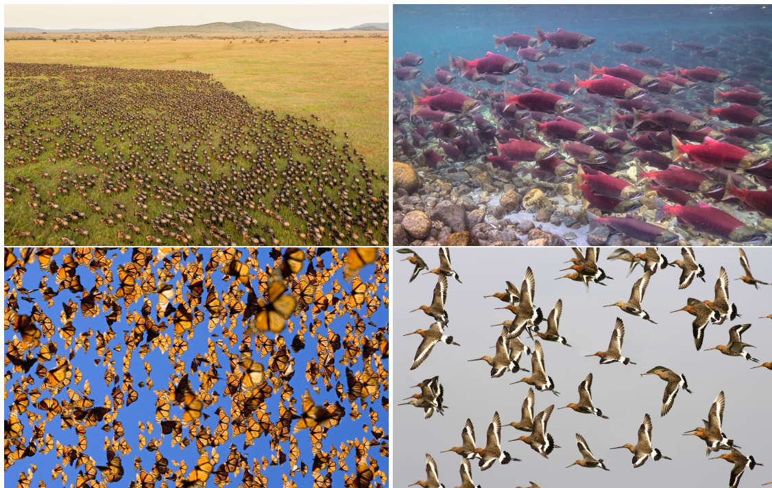
Figure 1: Collective movement is widespread in nature. Clockwise from top left: Wildebeest in the Serengeti, salmon in Alaska, godwits in the Netherlands and monarch butterflies in Mexico.

accounts, and calls for more research in the area around [24]. Thus, examining collective movement within its ecological context is a burgeoning field of study.