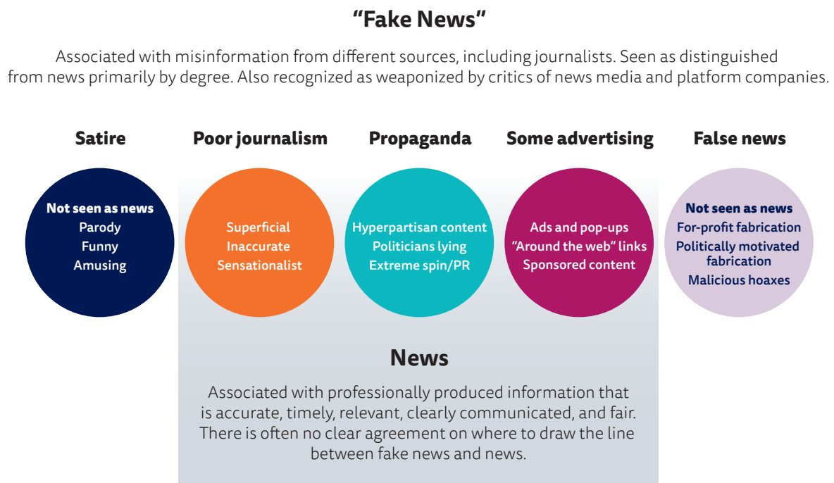
Figure 1. Audience perspectives on fake news

Based on our focus groups, we can identify different types of content that people associate with the term "fake news." Most focus group participants recognize that the term has been weaponized by critics of the news media as well as by critics of platform companies. They also clearly distinguish between satire and more maligns forms of fabrication. But that still leaves a wide and diverse range of content that many think of as fake news, including poor journalism, political propaganda, some forms of advertising, as well as false and fabricated content more narrowly. These latter categories are seen as different from journalism in general primarily by degree; for audiences, the difference between fake news and real news is not absolute but gradual. The main categories in popular understandings of fake news can be arrayed as in figure 1, above.