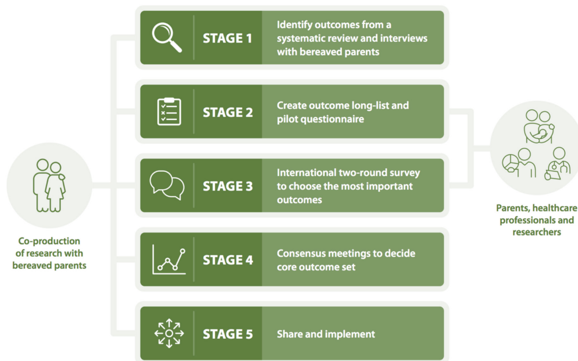
Figure 2 iCHOOSE study overview. iCHOOSE, International Collaboration for Harmonising Outcomes for Stillbirth research and carE.

set for stillbirth care research with the overall aim of improving outcomes for parents and the wider family. This collaboration is endorsed by the Core Outcomes in Women's Health (CROWN) initiative; the Medical Sociology and Health Experiences Research Group, University of Oxford; the National Stillbirth Centre for Research Excellence, Australia, The Stillbirth and Neonatal Death Charity (Sands); Tommy's National Centre for Maternity Improvement, Twins Trust, Star Legacy Foundation and International Stillbirth Alliance (ISA).