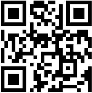
Figure S3 | Access to the online survey, “Measuring the impact of African swine fever in Southeast Asia,” for expert elicitation responses (Survey123).