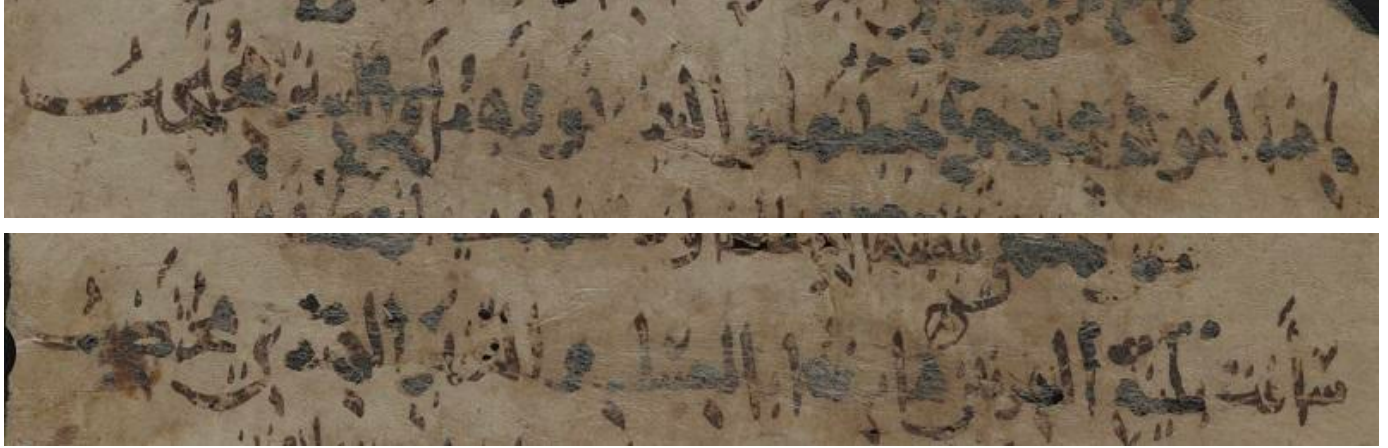
Fig. 2: Detail of NLI, Ms. Heb. 8333.192, recto, showing lines 3 and 7, verses 16–17.

Sāfat bi-tayyibati l-ʿirniṇi mārinuhā l bi-l-miski wa-l-ʿanbari l-hindiyyi mukhtaḍibū