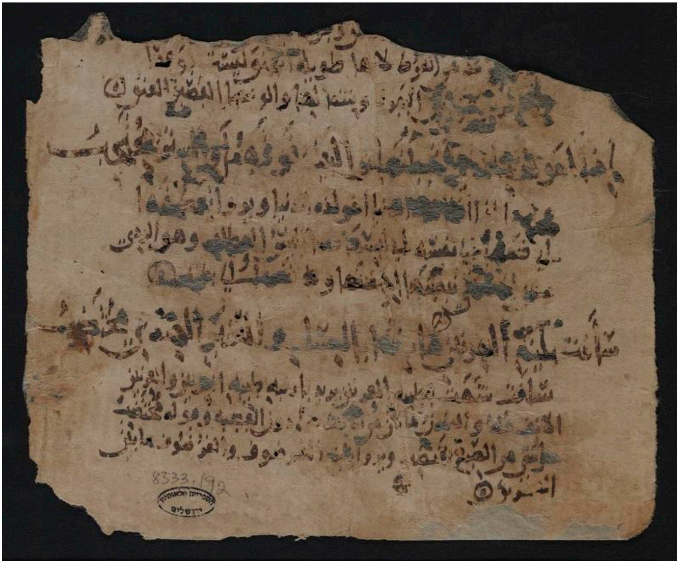
Fig. 1: NLI, Ms. Heb. 8333.192, recto. Reproduced with the permission of the National Library of Israel. "Ktiv" Project.