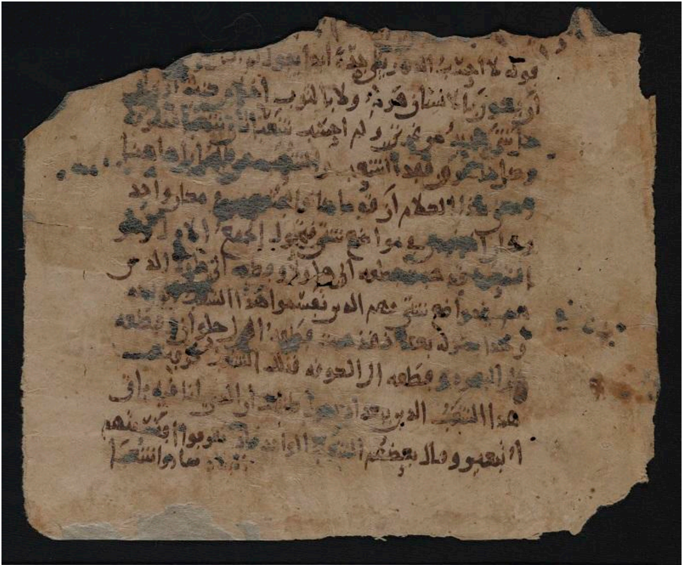
Fig. 3: NLI, Ms. Heb. 8333.192, verso.

The verso side (Figure 3) contains part of the commentary on verse 24 of the Diwan as edited by Abū Ṣālih (p. 38), which is verse 29 of Macartney's edition (p. 7). In the two preceding verses the poet thinks of the girl he fell in love with and "the nights of pleasure ( layāliya l-lahwi )" he had; then he says this verse, itself not on the fragment: