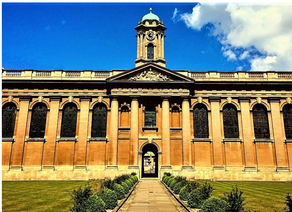
Figure 1. The Queen's College, Oxford University.