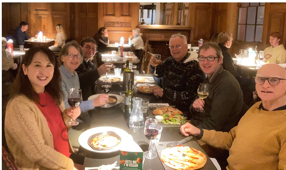
Figure 6. Relaxing after a Forum meeting.

the Japanese Aerospace Exploration Agency). The Forum has also enjoyed an important domestic connection: although it has never formally been a BSHM event, there has always been significant overlap between those regularly attending the Forum and those running the society, including several BSHM presidents and secretaries (see [2]).