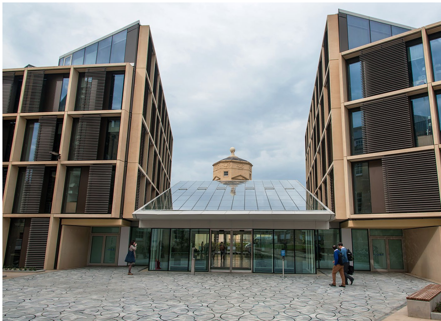
Figure 5. The Andrew Wiles Building, Oxford University's Mathematical Institute.