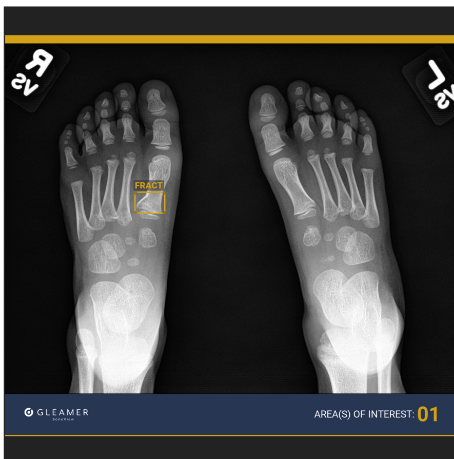
Figure 1 Image of Gleamer Boneview showing artificial intelligence-assisted overlay.

Over the last decade, advances in computer vision and machine learning have been used to augment interpretation of medical imaging. 10 Several artificial intelligence (AI) algorithms have been developed that are able to detect fractures on plain radiographs with a high degree of accuracy. 11 One such algorithm is the Gleamer BoneView (Gleamer, Paris, France) (see figure 1), which is currently the mostly widely used fracture detection algorithm in the NHS as well as worldwide (>800 sites in 30 countries). This algorithm estimates the likelihood of a fracture being present on a radiograph and provides users with three outcomes: fracture , no fracture and uncertain . If the likelihood has been estimated to be above a designated cut-off value, the area of abnormality is highlighted as a region of interest on a secondary image, which is made available to clinicians via their picture archive and communication system. If no abnormality is detected, this is also stated on the secondary image. 12 13 Prior studies have demonstrated that the algorithm is highly accurate