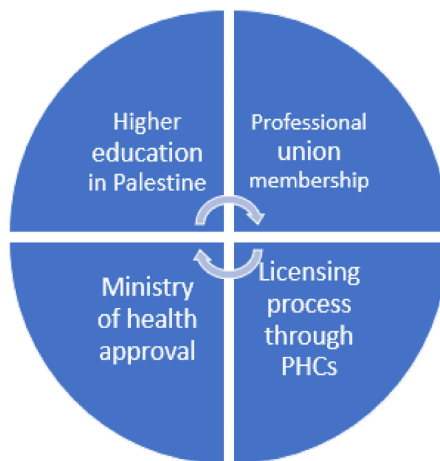
Figure 2 Licensing and accreditation cycle.

However, one participant suggested that the process for HWAR of new specializations starts with an application to the MoHE. Many participants affirmed the gap between academic education and practice. In addition, the absence of a recertification process was flagged. Several participants also raised the issue of the lax legal system in enforcing regulation implementation.