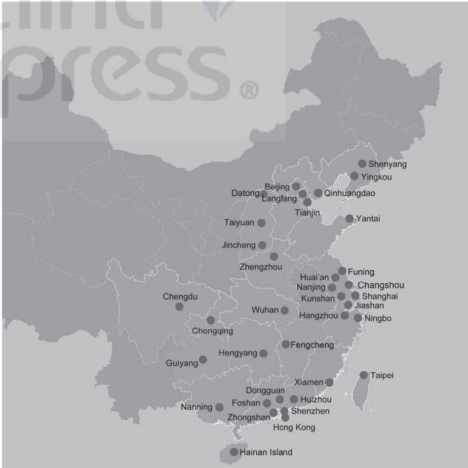
Figure 1. Foxconn locations in greater China, 1974-2015

Sources: Foxconn Technology Group company websites and annual reports.