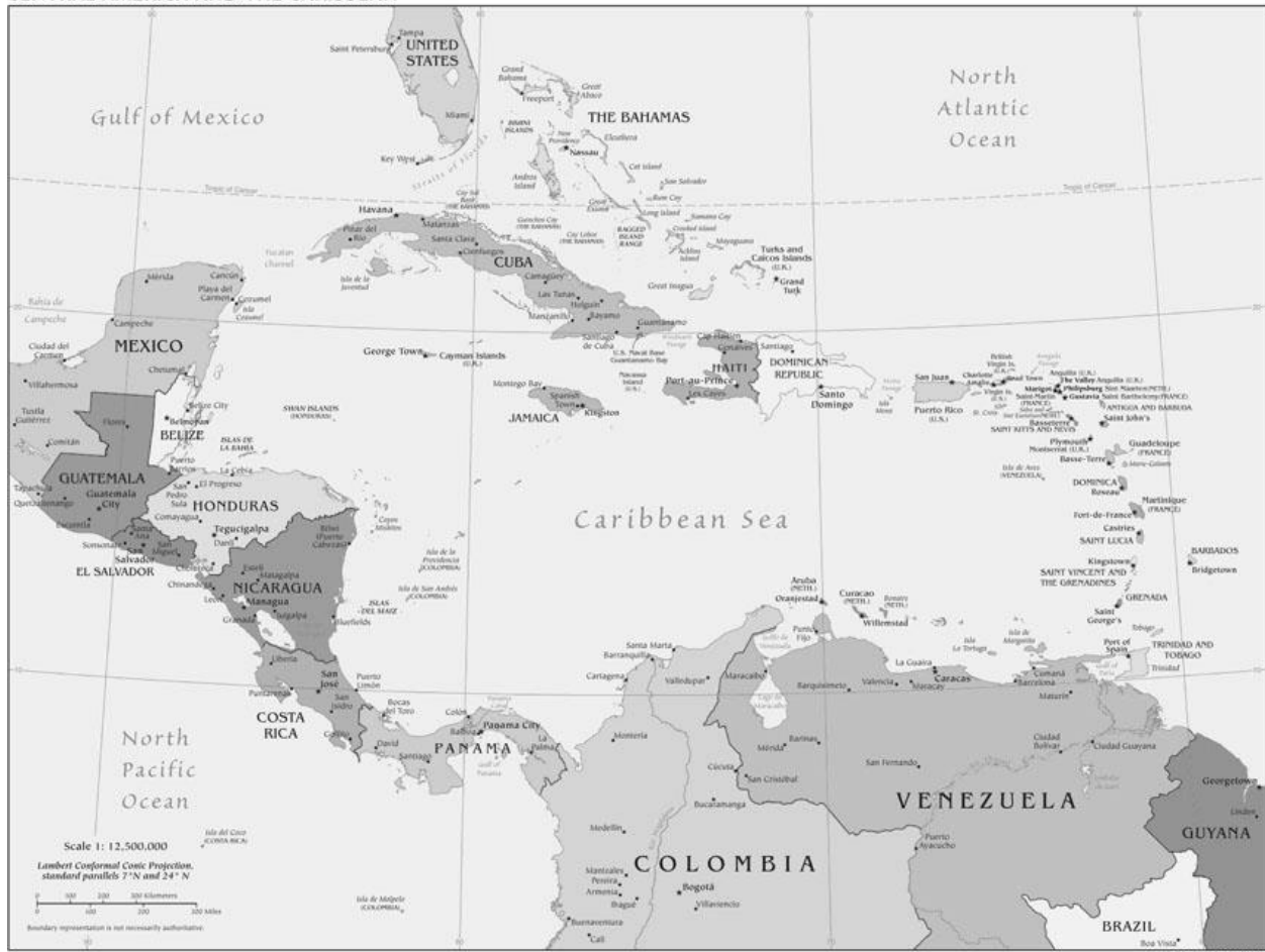
CENTRAL AMERICA AND THE CARIBBEAN