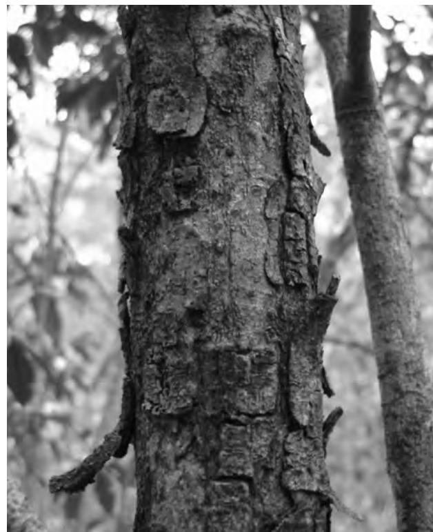
Fig. 3. Bark of Aglaiia cooperae, flaking in thick oblong scales, an unusual character for Aglaiia sect. Aglaiia.