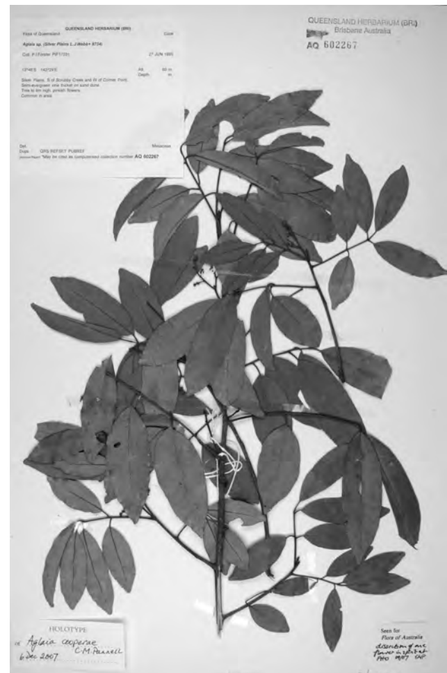
Fig. 1. Holotype of Aglaia cooperae Pannell (P.I. Forster PIF 17031 BRI).

The small or tiny flowers are complex in structure and highly perfumed, especially in male plants. All species have a fleshy aril. This usually completely surrounds the seed, but in A. elaeagnoidea from the Kimberley region, it is vestigial and the pericarp is fleshy. The fruits or arillate seeds are eaten, and the cleaned seeds dispersed,