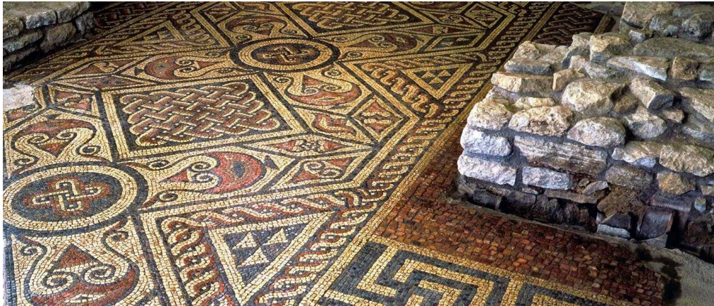
Fig. 7 b. The mosaics at North Leigh Villa. Photo with the colours enhanced (photoshoped?) by the English Heritage. Source: North Leigh Roman Villa | English Heritage

Today the piece is hosted by a large solid shed built for this purpose initially by the Duke of Marlborough in 1816 and renovated from time to time since, fig. 8 (2023).