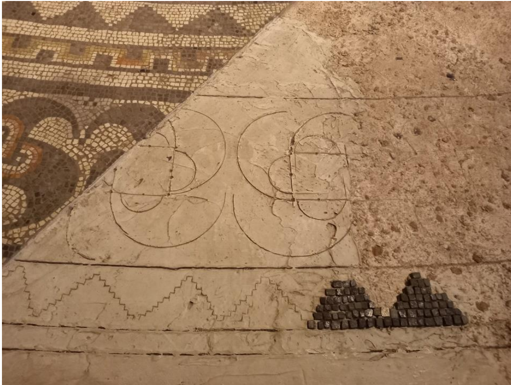
Fig. 10. Stage within the re-creation of the missing sections of the mosaic at the North Leigh Roman Villa; photo EED-V, 13 November 2023.