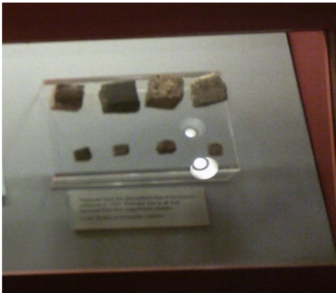
Fig. 4. Tesserae from the mosaic pavement discovered in 1712 at Stonefield. Museum of Oxfordshire, Woodstock; photo EED-V, 20th November 2024.

Margerie Venables Taylor summarized a part of the controversy; she personally believed these to be the remnants of a house that belonged to a local that lived during the Roman occupation. 11 A few tesserae from the pavement discovered at Stonefield are today within the Museum of Oxfordshire, Woodstock, UK, fig. 4 .