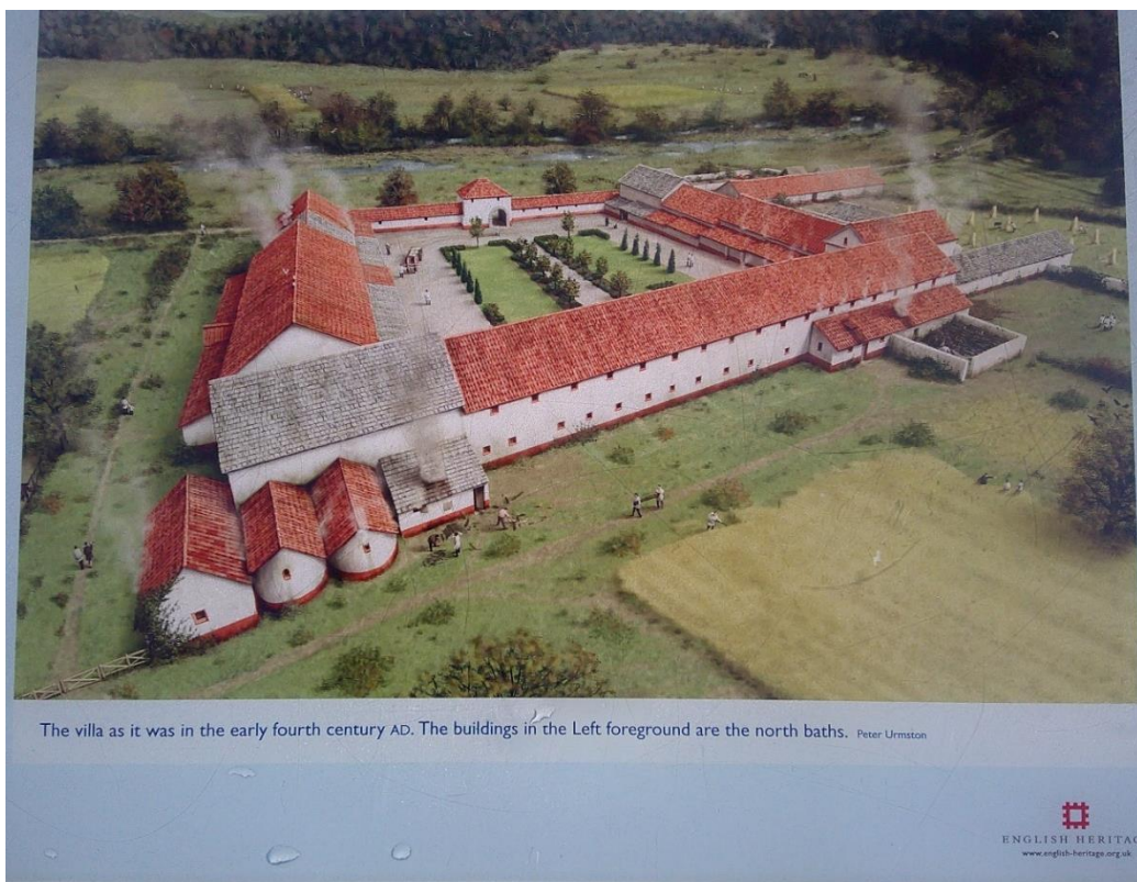
Fig. 6 a. The contemporary to us model of the original Roman Villa at North Leigh; photo of the image on the site EED-V, 10th September 2023.