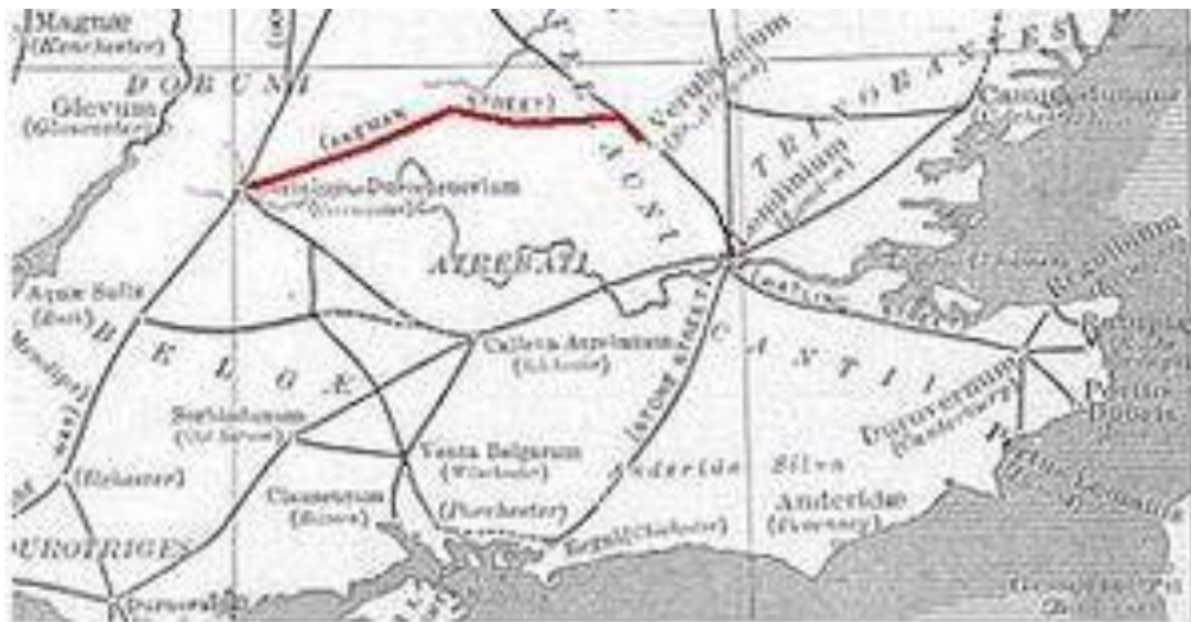
Fig. 1. Roman roads in south east England; Akeman Street, between the north of Verulamium and the Fosse Way at Corinium Dobunnorum is marked in red.

Today from Oxford the villa can also be approached following the itinerary shown on the map in fig. 2 .