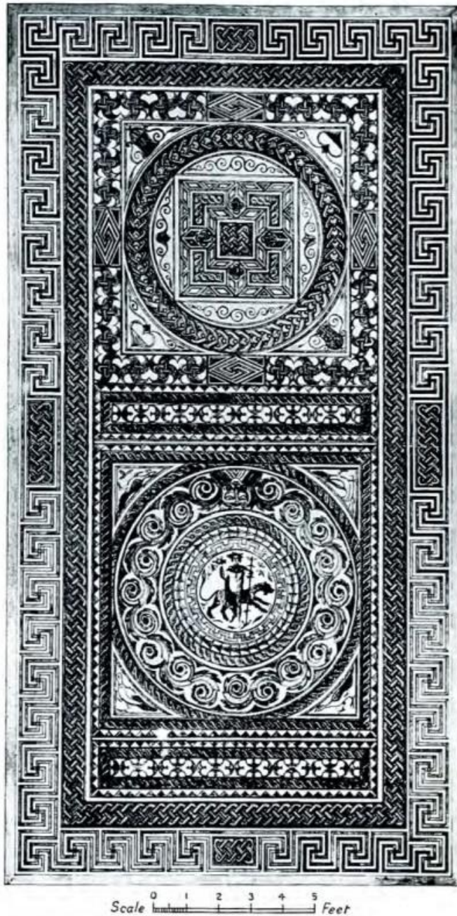
STONESFIELD, OXON. : mosaic pavement found 25 January, 1712.

Fig. 3. The only copy on paper of an engraving reproducing the mosaic found at Stonefield in January 1712. 9