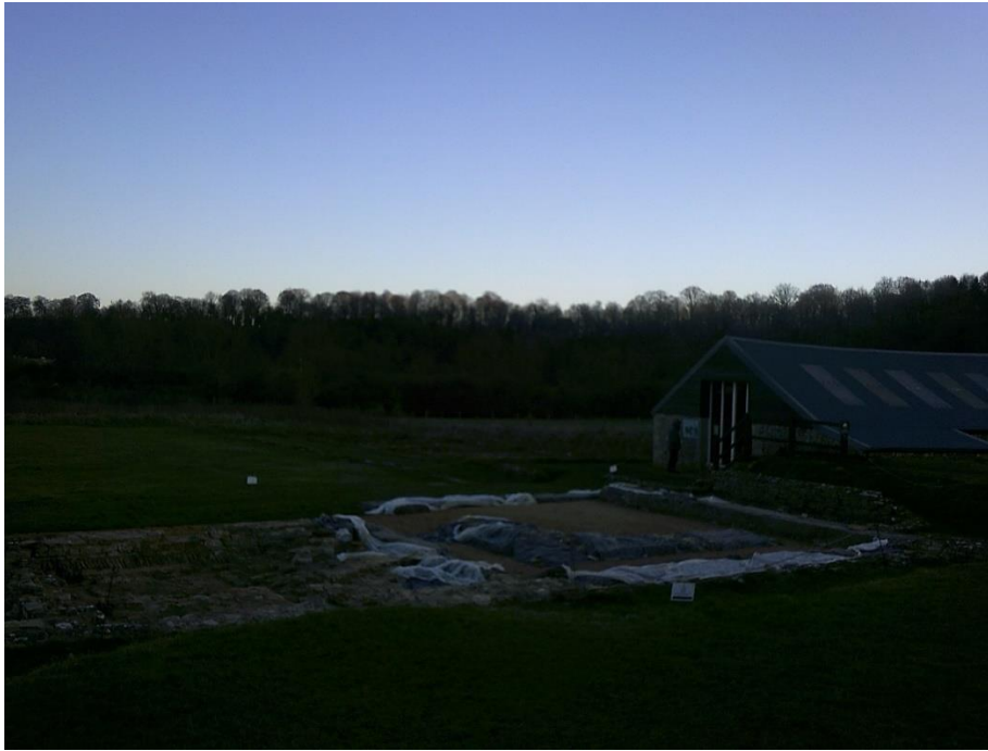
Fig. 9 a, b, c. The same building on the 20th of January 2025; photo EED-V.

The mosaic ( fig. 7 a, b ), on which I have particularly focused my research at North Leigh Villa since this medium is central to my long-time professional interest, underwent major maintenance work in 1929, when it was lifted and treated; reconstruction of the floor was carried out in 2023, fig. 10 shows that activity was in progress at that time. In January 2025, when I visited the place for the third time, I could see that further work on the mosaic is being carried out; fig. 11 a, b, c, d, e .