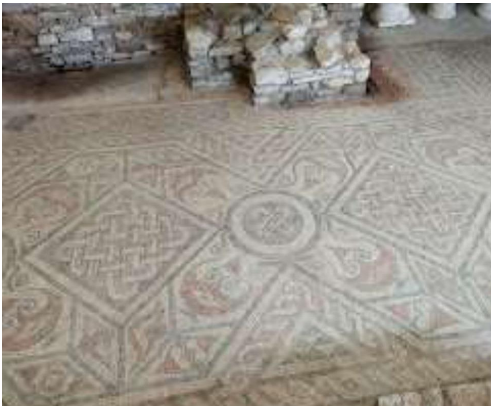
Fig. 7 a. The well mosaics preserved at North Leigh Villa; photo EED-V, 13th November 2023.

As I mentioned above, at least 19 mosaic floors existed in the ‘courtyard’ of the Roman Villa in North Leigh, where the archaeologists have identified 60 rooms. 30 These pavements protected the heating system under them and formed a part of the decoration of the house. What has survived until now consists in a well-preserved mosaic pavement, which decorates the floor in what the archaeologists assigned as Room 30, fig. 7a, b . 31