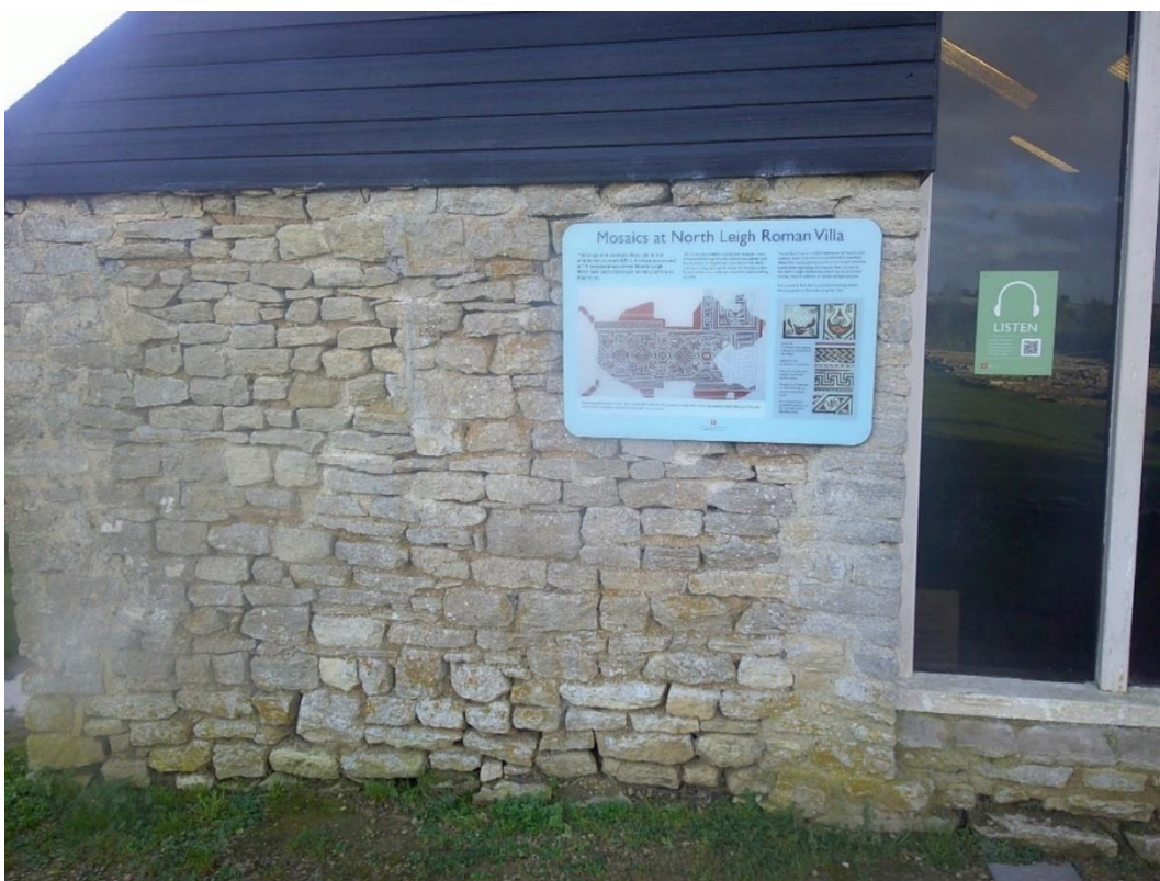
Fig. 8. The building that protects the mosaics; photo EED-V, 13 th of November 2023.

Today the piece is hosted by a large solid shed built for this purpose initially by the Duke of Marlborough in 1816 and renovated from time to time since, fig. 8 (2023).