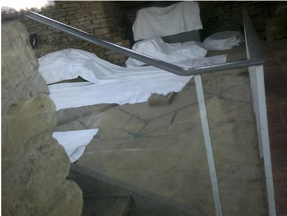
Fig. 11e. The current conservation work on the mosaic at the North Leigh Roman Villa; photo EED-V, 20 th January 2025

The surviving mosaic at North Leigh Villa is made of red, grey-blue, and white tesserae. The colours have faded, especially those on the tesserae in red. Conservation work is needed for the mosaic to regain its original shades and for the missing tesserae to be replaced by new ones. (Complex technical issues are involved in the latter since the composition of the original material and the technique involved in producing the new tesserae might not be identical to those used by the initial masters who decorated the villa).