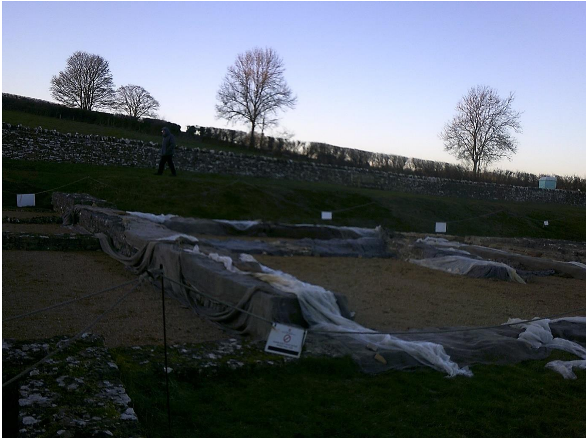
Fig. 6 c. Remains from the villa in January 2025