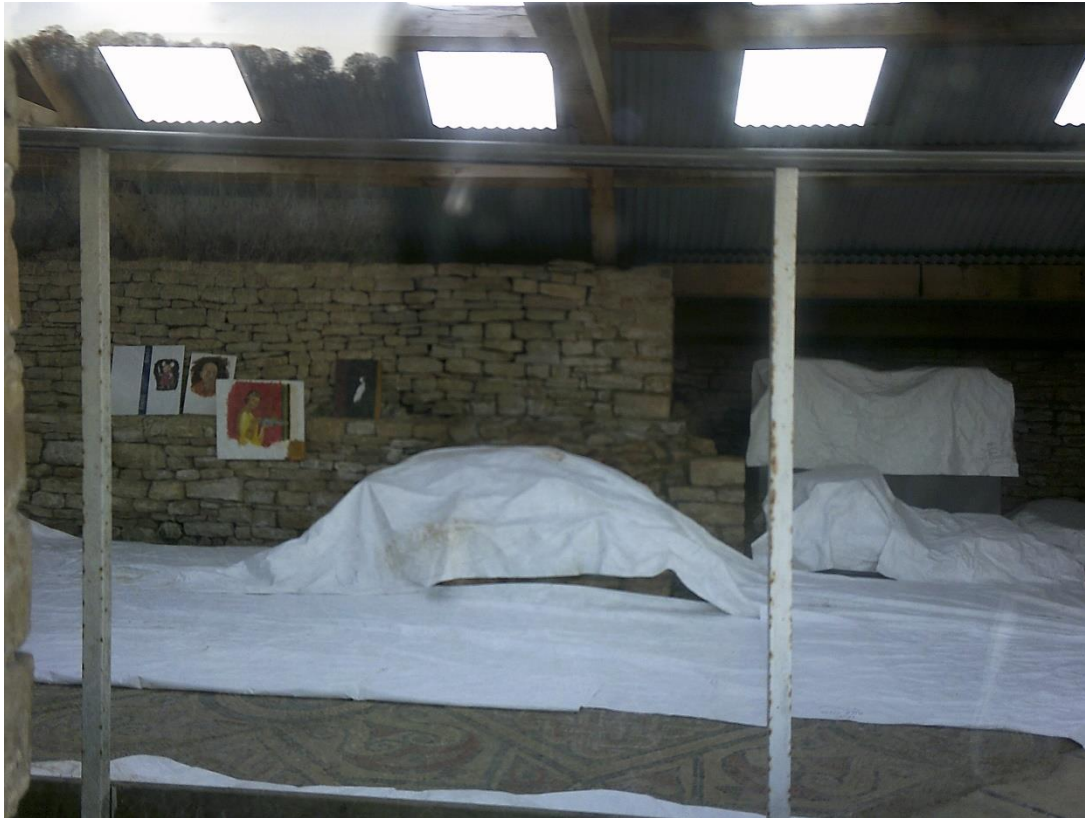
Fig. 11 b. The work for the protection and conservation of the pavement mosaic at the North Leigh Roman Villa; photo EED-V, the 20 th January 2025.