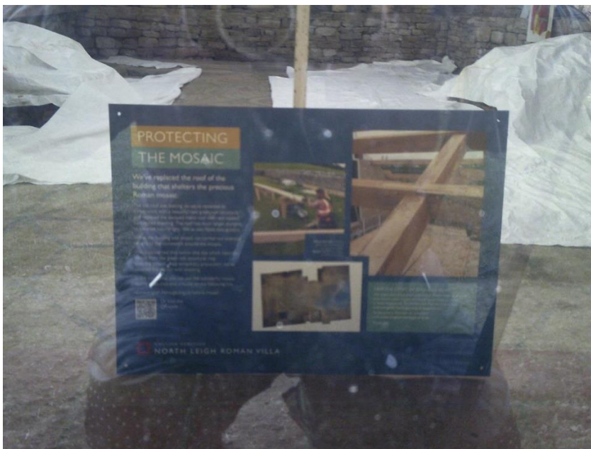
Fig. 11 a. The work for the protection and conservation of the pavement mosaic at the North Leigh Roman Villa; photo EED-V, 20 th January 2025.