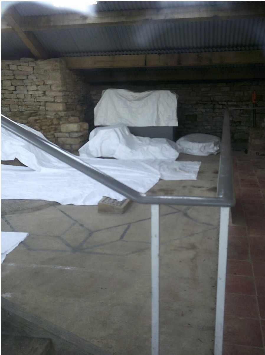
Fig. 11 d. The work for the protection and conservation of the pavement mosaic at the North Leigh Roman Villa; photo, 20 th January 2025.