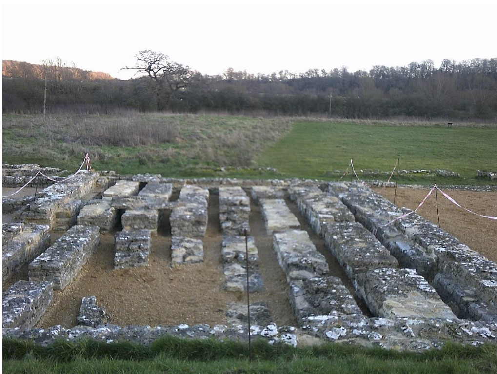
Fig. 6 b. Remains from the villa in November 2023; photo EED-V, 20th November 2024.