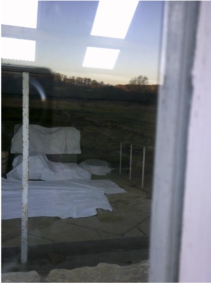
Fig. 11 c. The work for the protection and conservation of the pavement mosaic at the North Leigh Roman Villa; photo EED-V, 20 th January 2025.