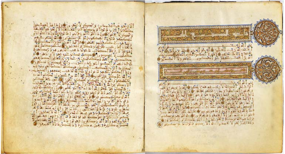
FIGURE 9 Istanbul University Library, Ms. A 6755, ff. 3b–4a, with the Fātiḥa and the beginning of Sūrat al-Baqara (1:1–2:25)