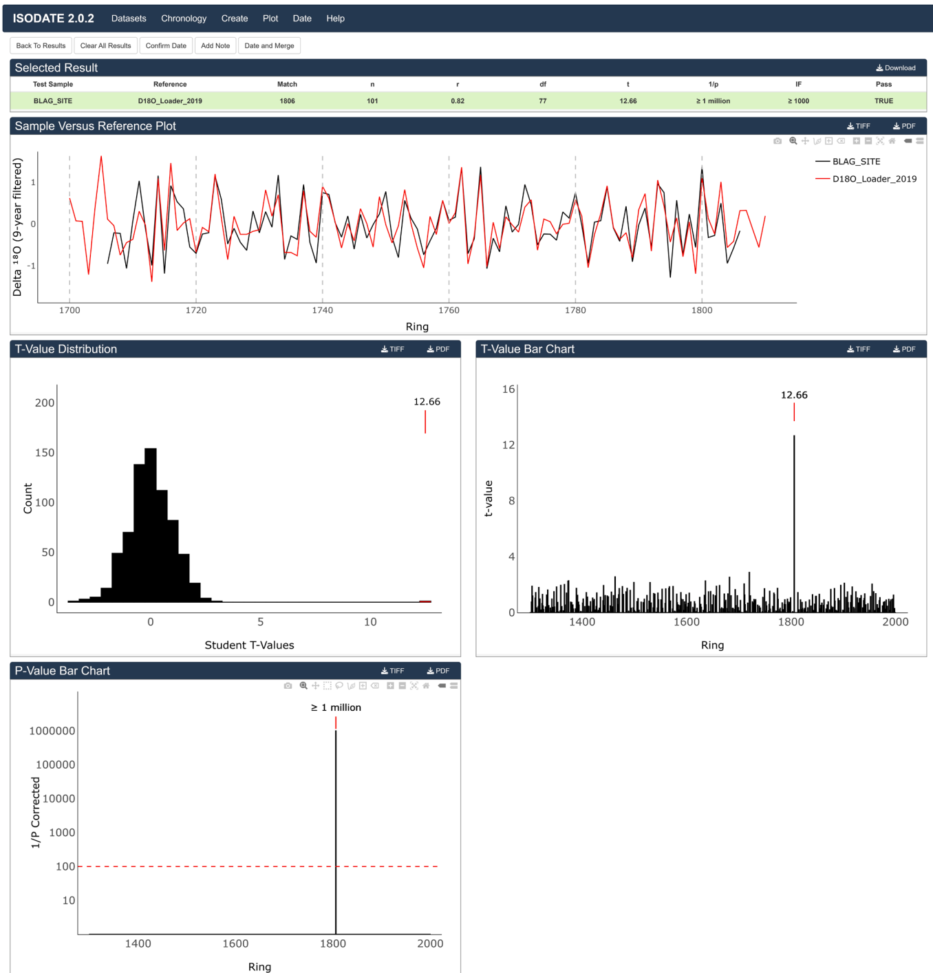
Fig. 1. Example of the detailed results page between a sample of unknown age and the Loader et al. (2019) reference chronology.

Sample series are loaded into one of three windows, named: Working, Reference and Archive. The Working window is intended for