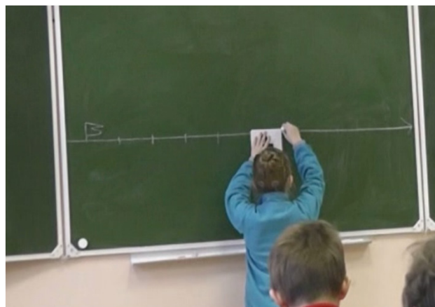
Figure 1: Marking the number line with an arbitrary unit

The Russian teacher, Olga, began by sketching a horizontal line across the board, telling her class that this was a number line before asking what was missing. Over the next two or three minutes, four volunteers, with appropriate commentary from Olga, completed the number line as follows. The first drew a small arrow at the right hand end of the line to signify that numbers go from left to right also extend indefinitely. The second drew a small flag near to the line’s left hand end to represent the start or zero point. The third, using what looked like a postcard, added regular intervals, as shown in Figure 1. The fourth added the integers correctly.