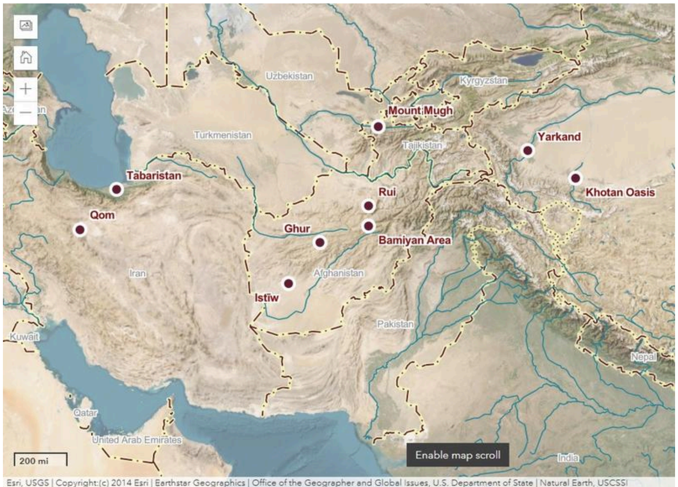
Map 1. Yarkand can be found on the Yarkand River. Above snapshot is taken from the interactive map on the homepage of this website.

This month's document comes from a cache of documents discovered in a garden on the outskirts of modern Yarkand, in today's Xinjiang Uyghur Autonomous Region of China, at the southwestern end of the Tarim Basin. Found in 1911, the documents went missing again, and only the photographs of some of them are available. (To learn more about the discovery and fate of the documents, read this blog .)