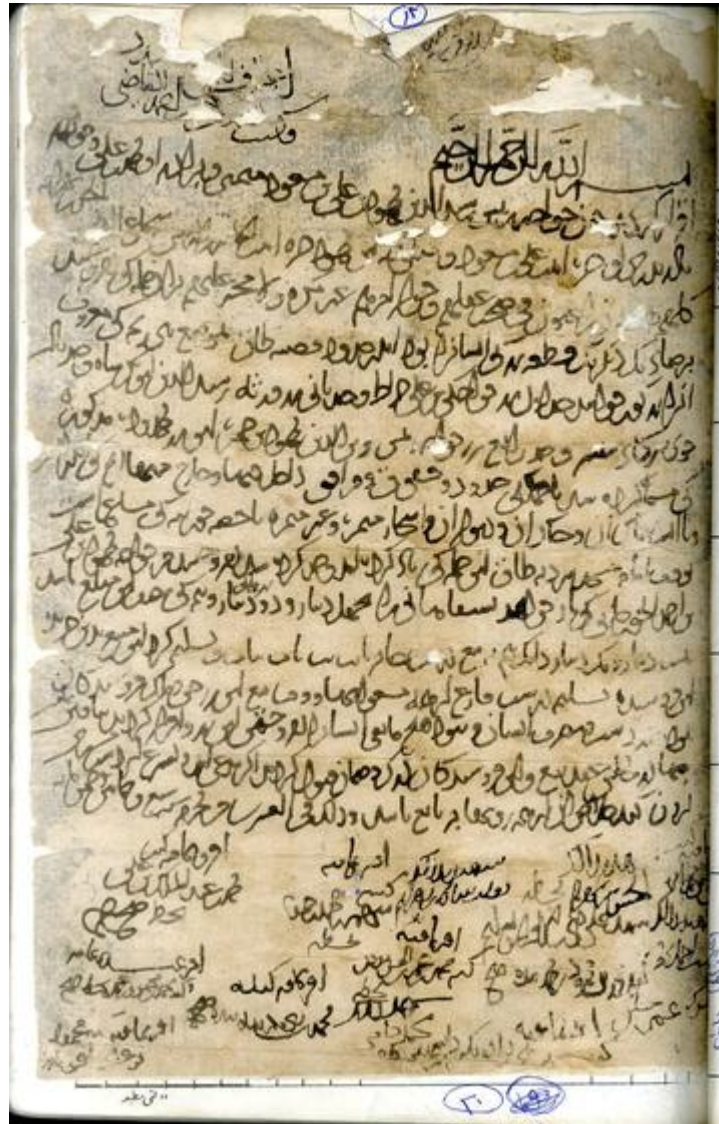
Figure 2. Afghanistan National Archives, Firuzkuh 6

My comparandum, Afghanistan National Archives, Firuzkuh 6, is a land sale document written in New Persian. It is in a better physical condition than its Old Uyghur counterpart above. It acknowledges (the term used is again iqrār ) the sale of a plot of land near a village called Ṭāq in 587 AH/ 1191 CE (Firuzkuh is shown as Ghur on Map 1; Ṭāq’s location remains unidentified).