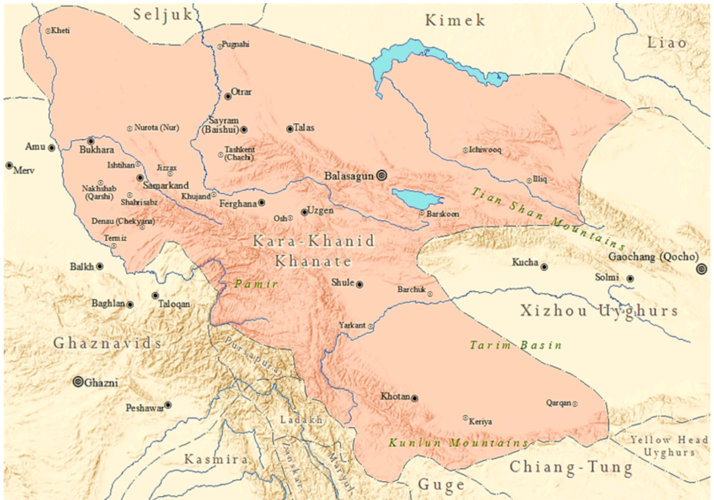
Map 2. Qarakhanid Khanate as of 1006 CE, when it reached its greatest extent

Between ca. 1041-1210 CE, Yarkand was part of the Eastern Qarakhanid Khanate. The Qarakhanids were the first Muslim Turkic dynasty, and the Qarakhanid Khanate was ruled by a Muslim ruler from 955 CE. The Khanate split into eastern and western parts in c. 1041 CE, roughly separated by the Tien Shan mountain range.