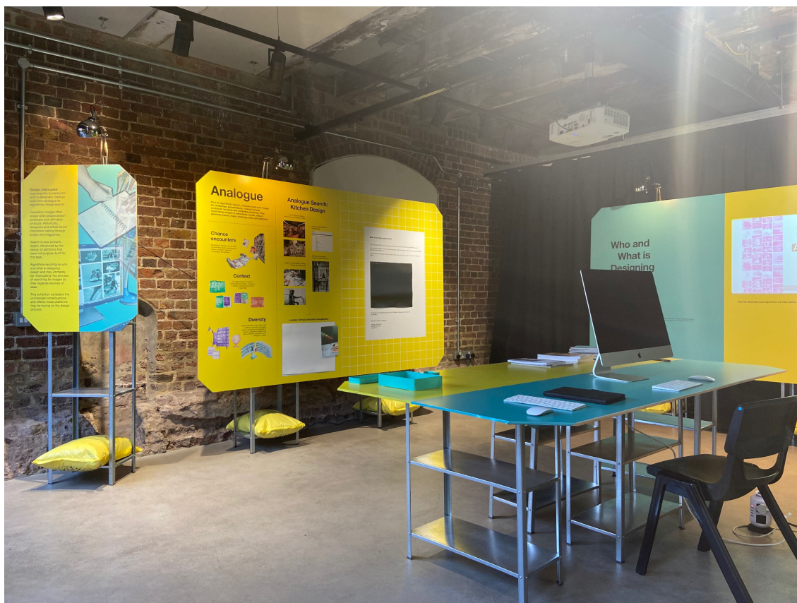
Fig. 1. An image of the Design, Interrupted exhibit in a gallery space in London. Here, the analogue display board and the table where participants completed their interactive task are displayed. Image and exhibit design credit: Parasite 2.0.