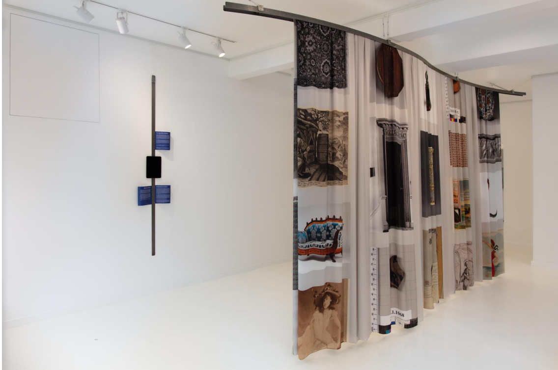
Fig. 2. An image of The Algorithmic Pedestal exhibit in a gallery space in London. Here, the algorithmic curation is displayed on one side of the silk fabric. Image and exhibit design credit: Parasite 2.0.