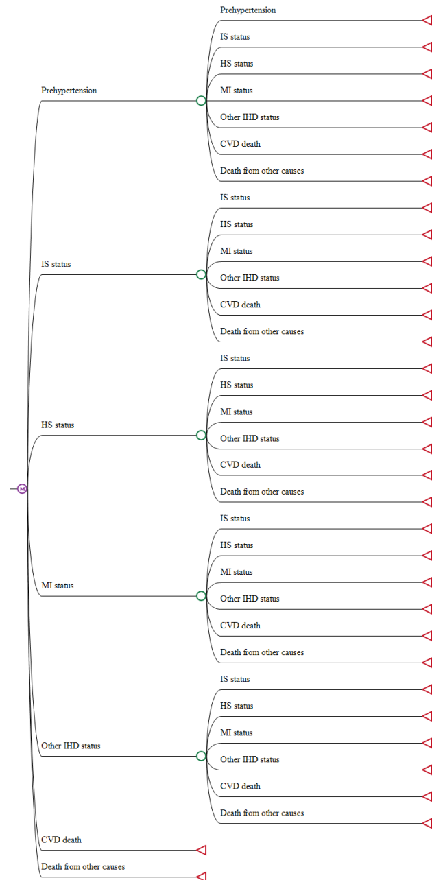
Figure S1. Structure of the Markov model

IS: ischemic stroke; HS: hemorrhagic stroke; MI: myocardial infarction; IHD: ischemic heart disease; CVD: cardiovascular disease.