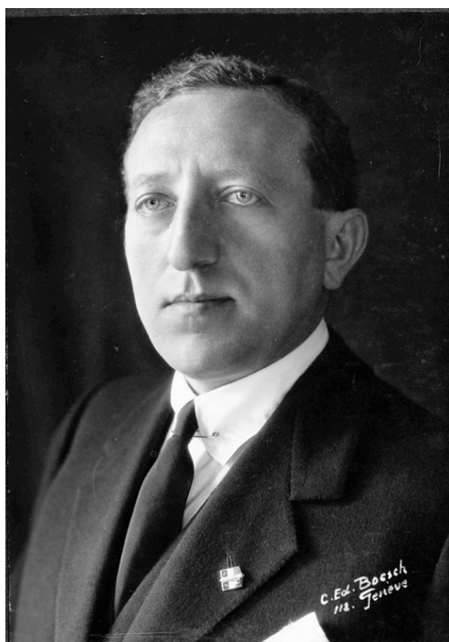
Giacomo Paulucci di Calboli (1927-32)