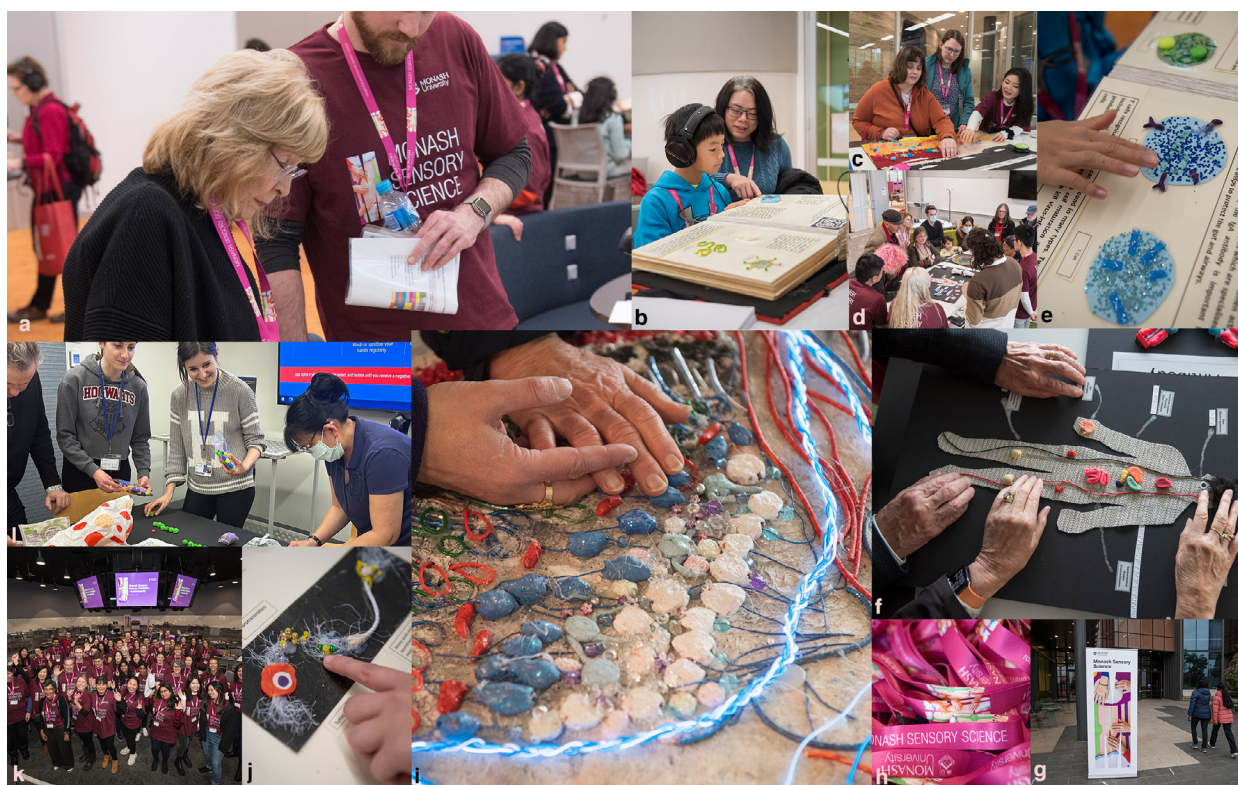
Figure 2. Monash Sensory Science Autoimmunity Exhibition for blind, low-vision and diverse-needs audiences, 2023. Clockwise from left to right: (a) an audience member explores tactile models with an exhibition guide, (b) a child reads a multisensory science book with headphones and fiducials, (c, d) attendees explore tactile posters, (e) exploring T cells in the interactive science book, (f) exhibition goers explore a vibrating human figure wired to demonstrate multiple sclerosis and other locations of autoimmunity, (g) visitors to the autoimmunity exhibition, (h) a nest of Monash Sensory Science lanyards, (i) a visitor is guided through an exploration of the tactile retina map, (j) tactile representation of synapsing neurons (k) the Monash Sensory Science team, (l) scientists and designers workshoping the development of accessible models.

for Disability Access to Science during Berlin Science Week.