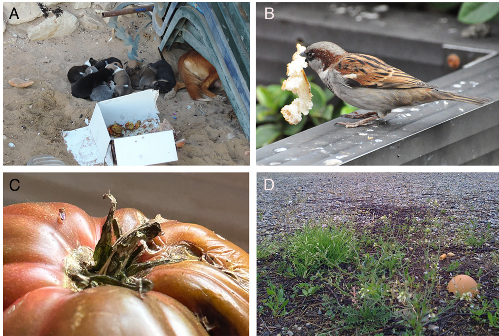
Fig. 1. Populations that thrive in areas of human disturbance. Four examples of domestic populations include (A) dogs, (B) house sparrows, (C) some populations of fruit flies, and (D) some populations of Arabidopsis.

Presuming that the modern state of domestic populations can be applied to the process that led to them would, to paraphrase Gould, be the equivalent of conflating current utility with historical origin (23). Today, nearly all chickens are raised for consumption, but the initial stages of chicken domestication were driven not by human exploitation but by the arrival of dry rice agricultural practices, which attracted red junglefowl (24). It took more than 500 y for chickens to become part of human diets (25). This pattern of shifting relationships with domestic populations, often driven by changes in lifeways or cultural taboos, is common.