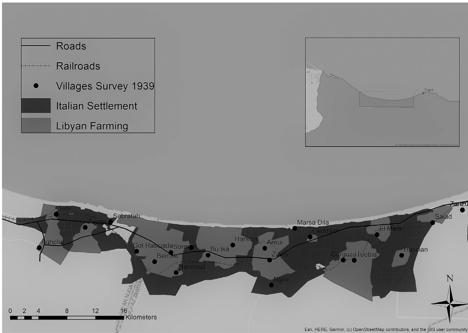
FIGURE 2 Example of agricultural settlement in the area of Zavia. Note: Example of Italian settlement pattern around traditional Libyan intensive-farming oases in the area of Zavia.

faced severe constraints on the ground. In this sense, while politics undoubtedly tried to influence the pattern of agricultural settlement in Libya, pre-existing conditions shaped the process significantly, to the point where the actual distribution of colonists across the country developed largely independently (without being endogenously determined, that is) of the traditional patterns of Libyan farming.