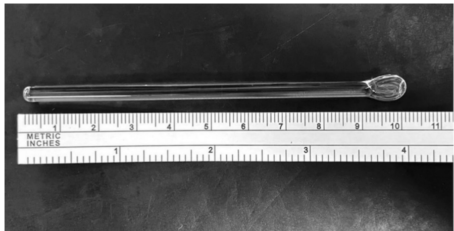
Fig. 1 The spatulated glass rod

Using the search term 'double eversion of upper eyelid', 15 articles were retrieved, from 1979 to 2023, of which seven were included. Eight articles were