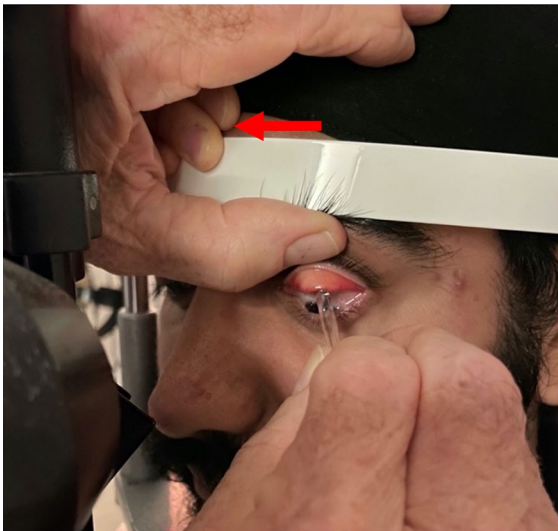
Fig. 3 The spatulated glass rod is in place here prior to further eversion of the upper lid in order to inspect the fornix directly. Note that the clinician's thumb is stabilising the patient's upper lid. Note also that the assistant's ipsilateral left hand (arrow) is ensuring that the patient's forehead is firmly secured against the forehead rest of the slit lamp

The clinician, keeping the patient's double-everted upper lid in position with the SGR, identifies the foreign body. While maintaining the foreign body in view, the clinician is handed the required forceps by the assistant. The foreign body is subsequently removed under direct vision with the benefit of slit lamp magnification and illumination. The maintained