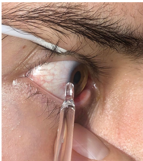
Fig. 2 Corneal indentation using the spatulated end of the spatulated glass rod (note that the spatulated end of the SGR is seen side-on here)

A recently well-documented, published, and now increasingly widely accepted technique in the emergent management of acute angle closure (AAC), is definitive CI [4, 5]. Following instillation of topical oxybuprocaine eye drops, with the patient seated and immobilised on the slit lamp and looking straight ahead, the clinician applies anteroposterior compression on the limbus/cornea with the SGR, for repeated cycles of 30 seconds on and 30 seconds off (Fig. 2). Generally, fewer than ten cycles are required to control AAC, normalising the intraocular pressure. This results in almost immediate resolution of corneal oedema, permitting safe YAG laser peripheral iridotomy. If necessary, cataract and implant surgery can be carried out later, as this definitively deepens the anterior chamber and prevents AAC [6].