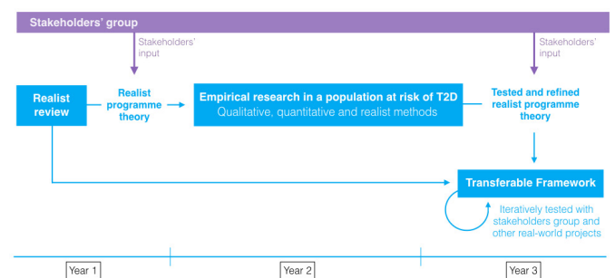
Figure 2 Overview of the study design. T2D, type 2 diabetes.

In parallel and as represented in figure 2, we will set up a stakeholder group comprising representatives of