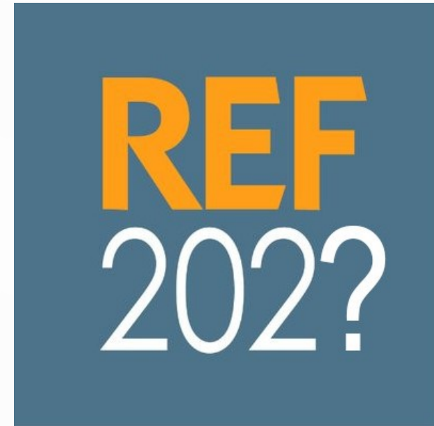
'Next REF' Open Access Requirements

“Both UKRI and the UK higher education funding councils note that the scope of an open access policy for the future national research assessment exercise is much broader than the UKRI Open Access Policy. This will be considered when developing the future national research assessment position.”