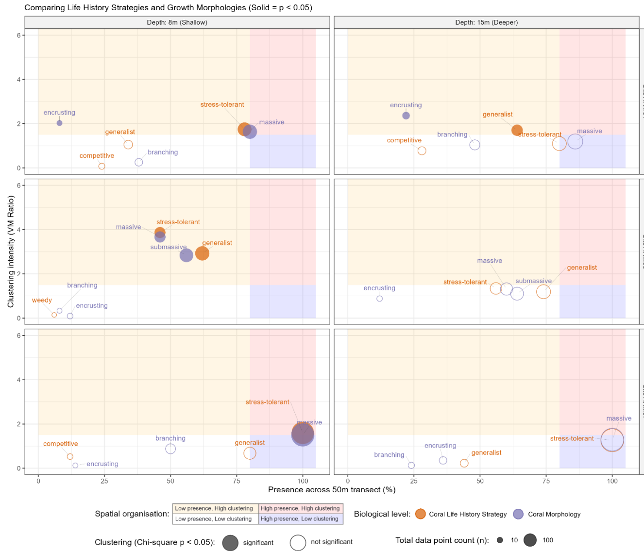
Supplementary Figure 2. The spatial organisation of coral life history strategies and coral morphologies in wester Aldabra Atoll